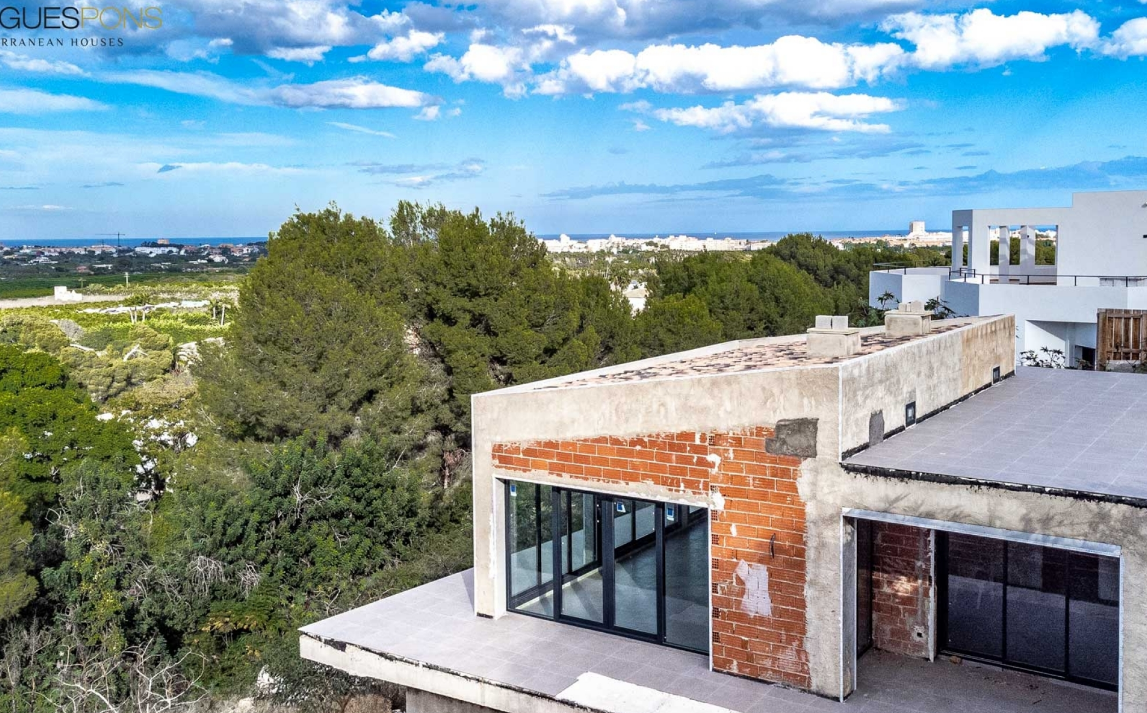
Villa in Puerta Fenicia, Jávea

PARTIDA COMUNES - ADSUBIA, JÁVEA/XÀBIA - REF. V-334