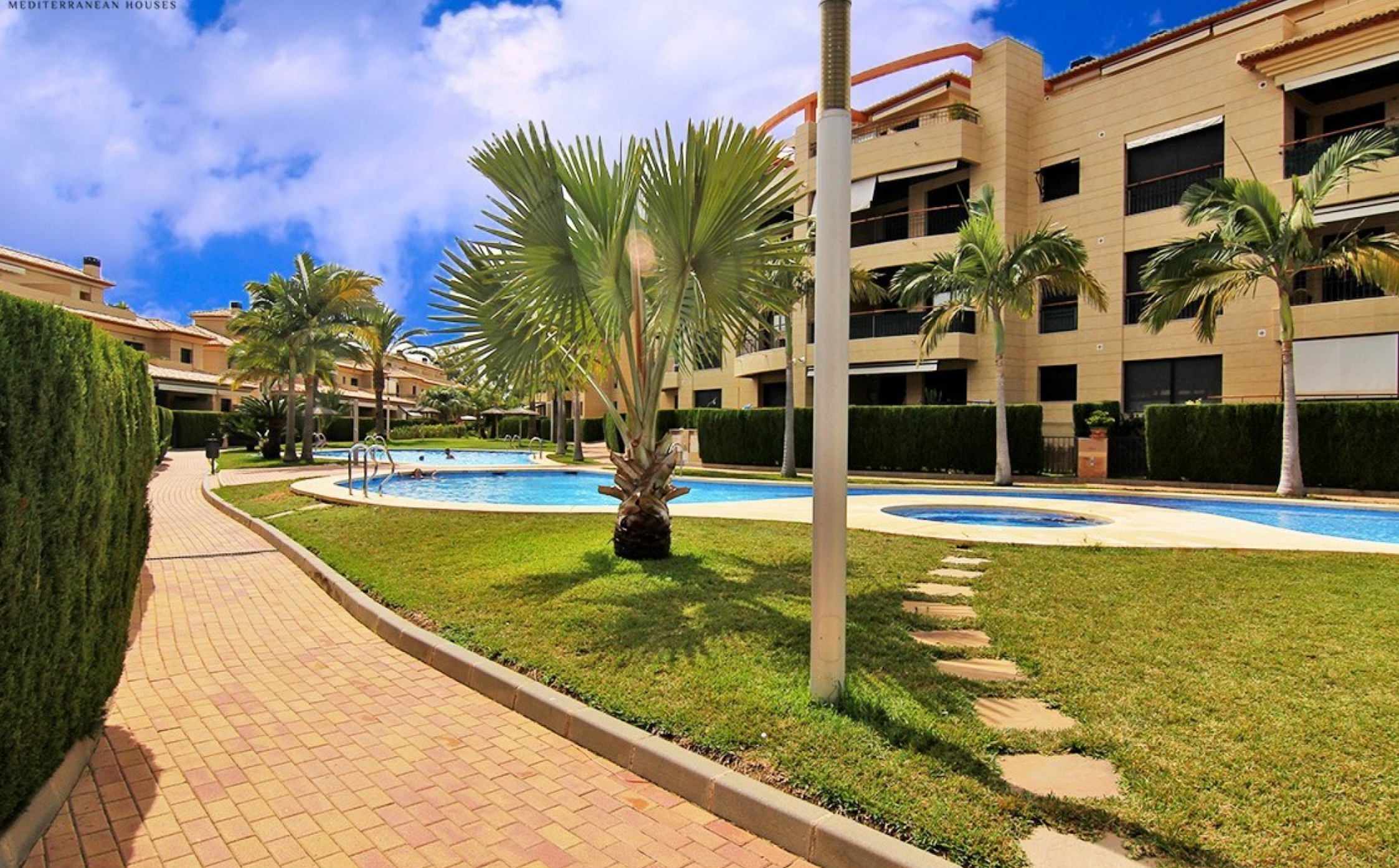
3 bedroom apartment in port PORT, JÀVEA/XÀBIA - REF. A-102