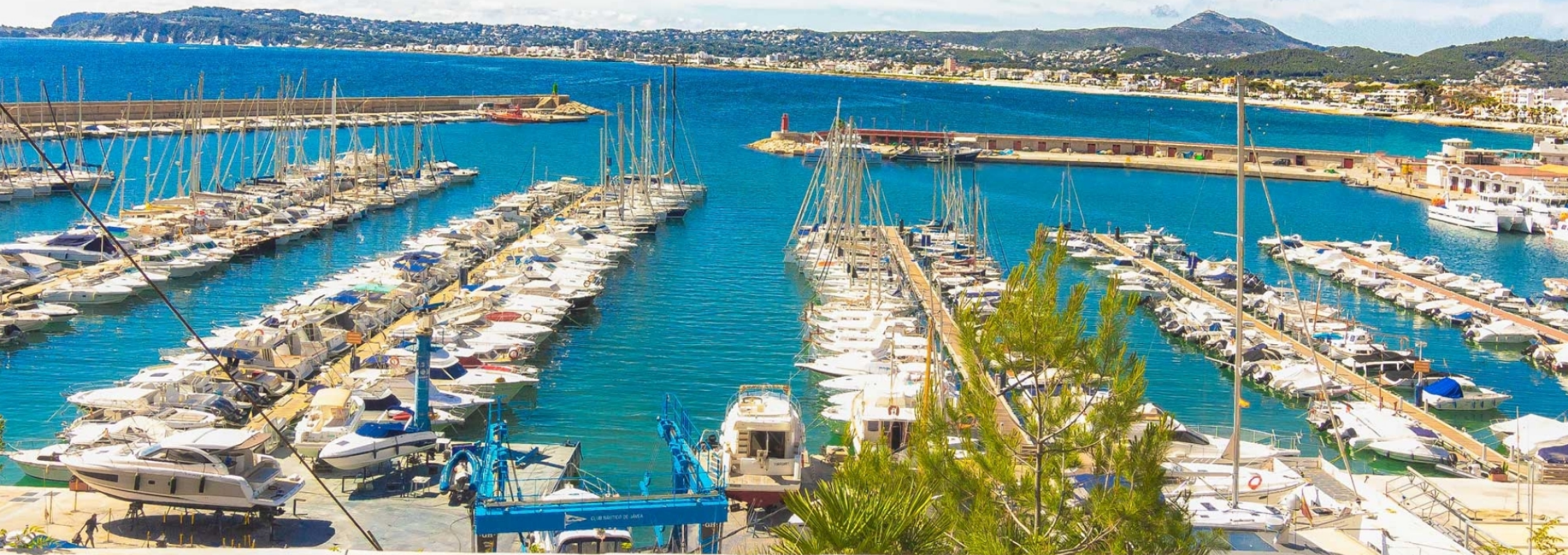
Amazing house on the top of the port of Jávea PORT, JÁVEA/XÀBIA - REF. V-472