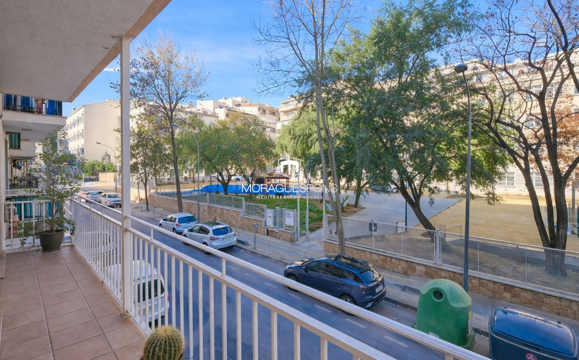
Apartment for sale in the centre of Jávea OLD TOWN CENTER, JÁVEA/XÀBIA - REF. A-1569