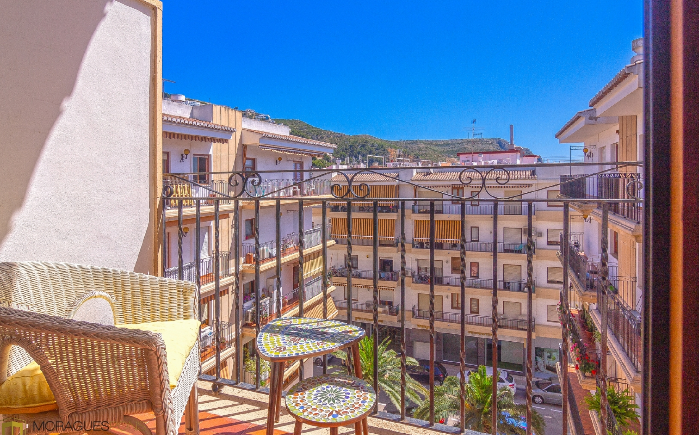
Apartment for sale in the port of Jávea PORT, JÁVEA/XÀBIA - REF. A-368