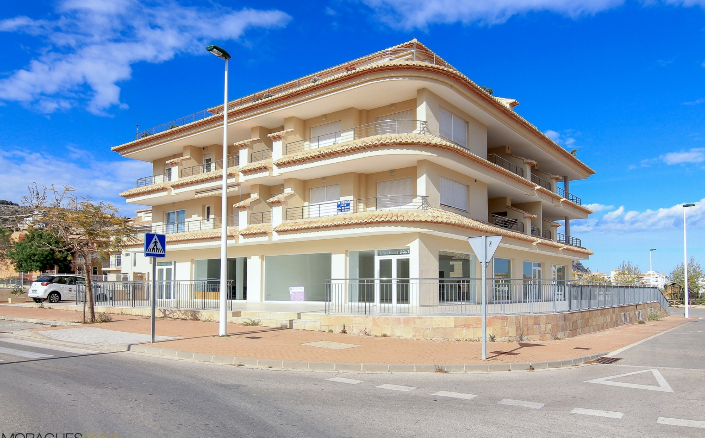
Apartment for sale in the port of Jávea PORT, JÁVEA/XÀBIA - REF. A-391