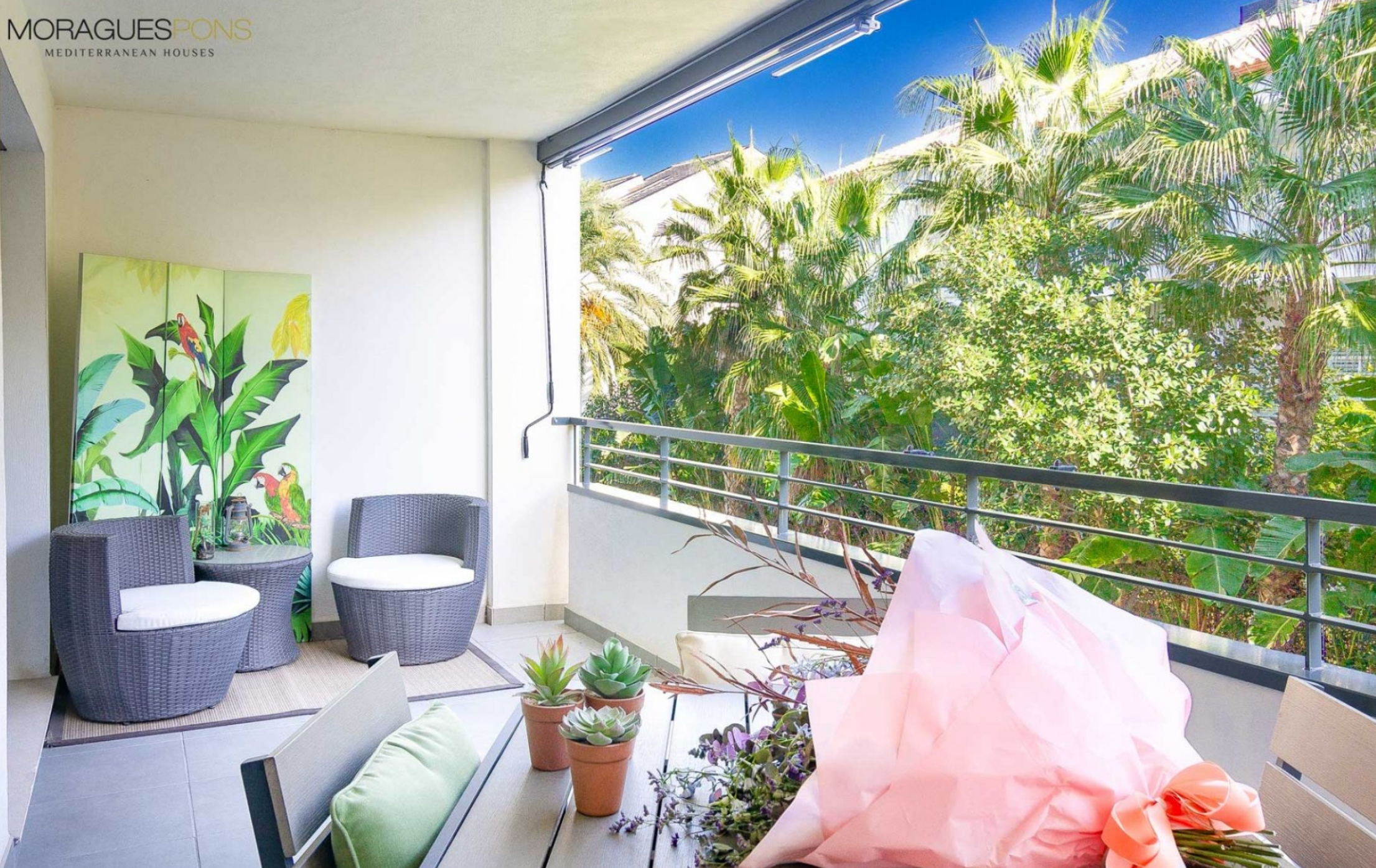
Apartment in Javea , close to the beach

MONTAÑAR - EL ARENAL, JÁVEA/XÀBIA - REF. A-347