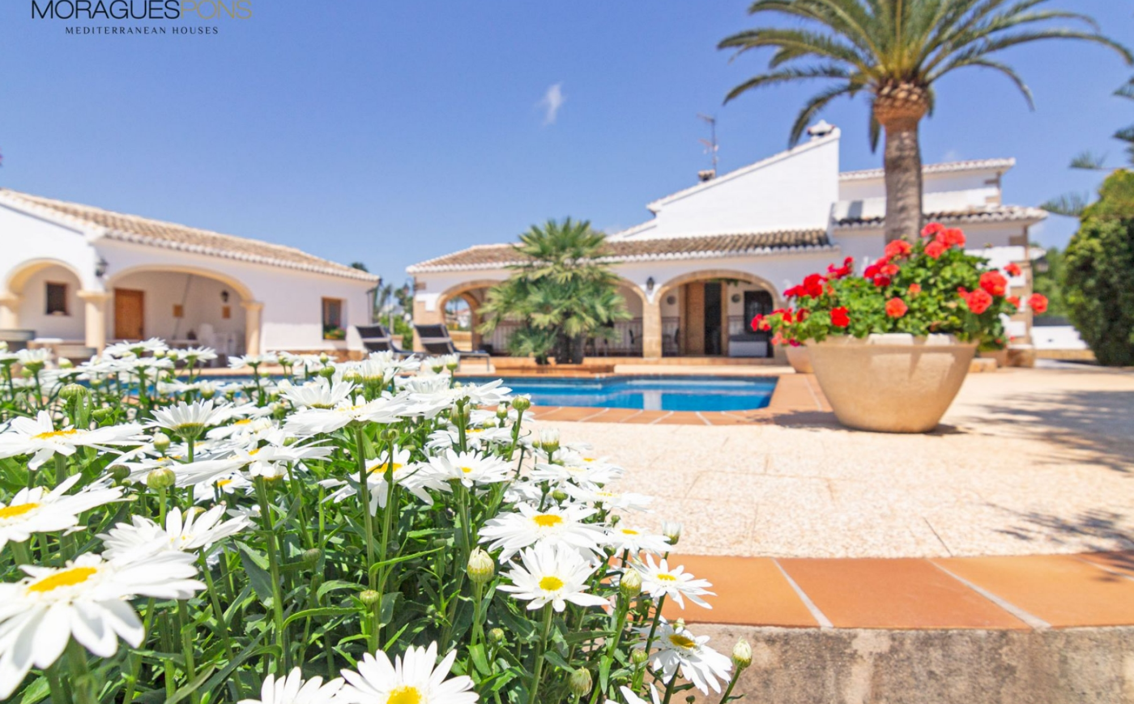
Beautiful villa at the outskirts of the old town of Javea OLD TOWN CENTER, JÁVEA/XÀBIA - REF. V-385