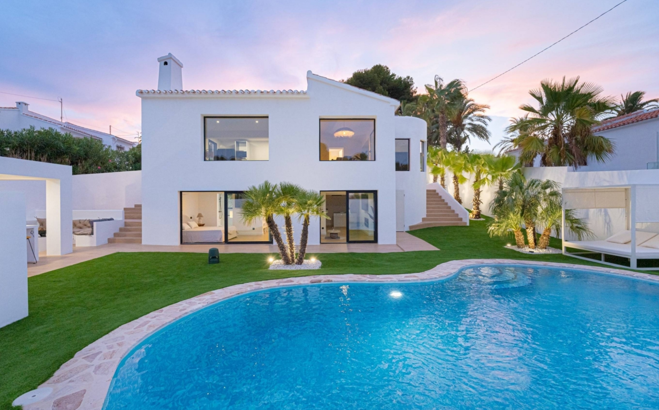
Completely refurbished villa next to the Arenal beach of Jávea. CAP MARTÍ - PINOMAR, JÁVEA/XÀBIA - REF. V-503