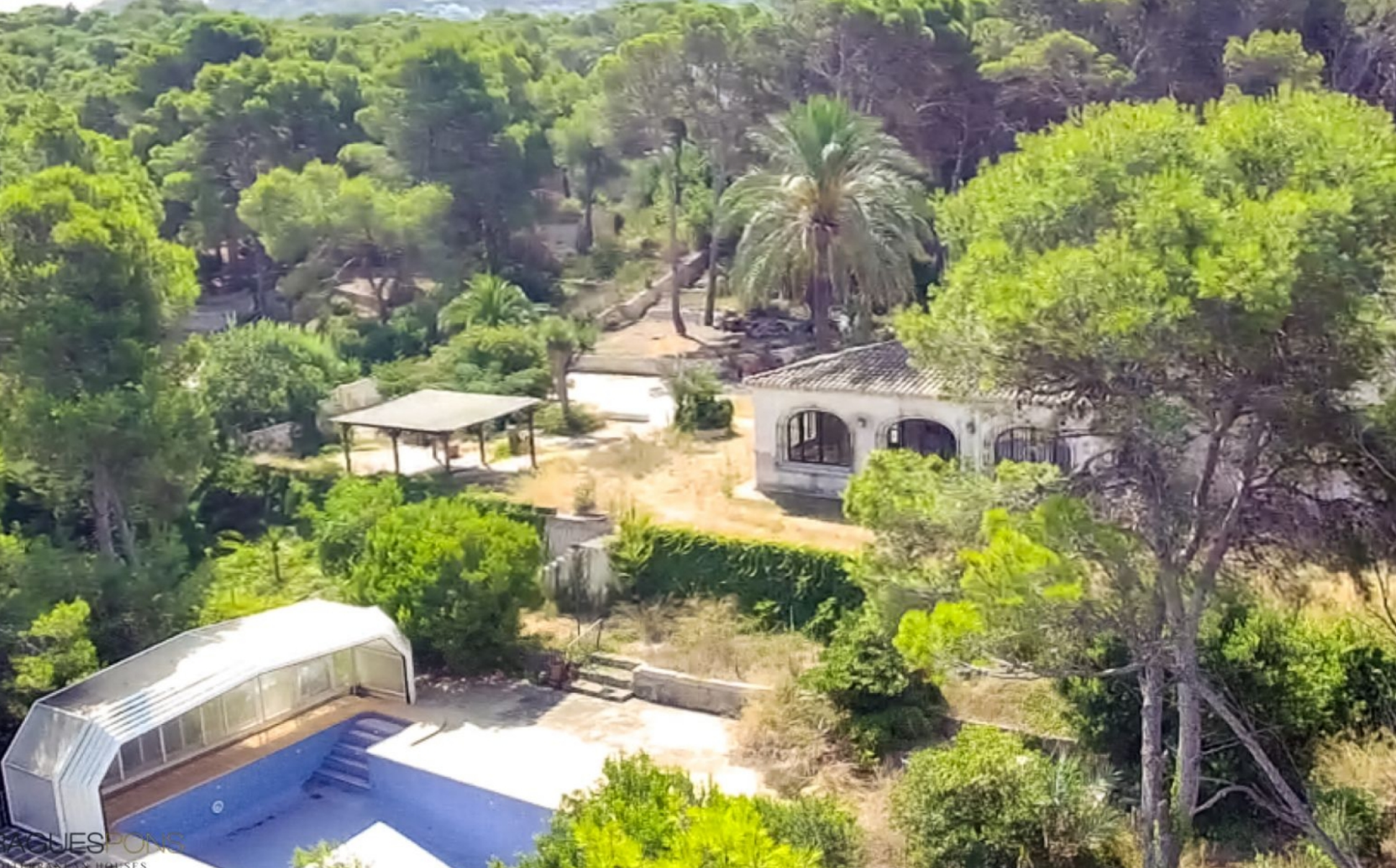
Completely refurbished villa with pool in Jávea BALCÓN AL MAR - PORTICHOL, JÁVEA/XÀBIA - REF. V-421