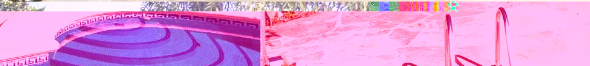
country house in need of renovation in Jávea OLD TOWN CENTER, JÁVEA/XÀBIA - REF. V-429