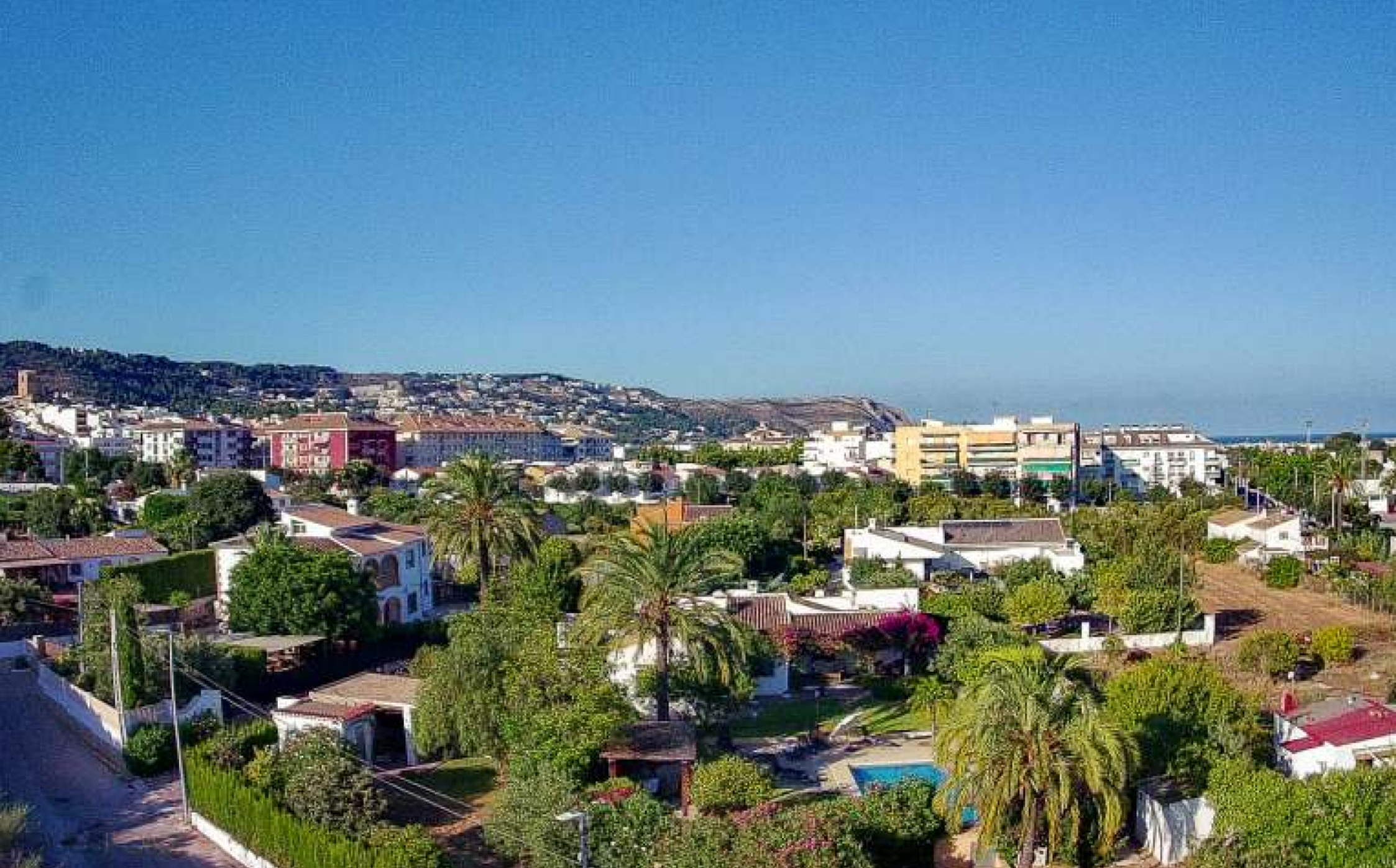
country house in need of renovation in Jávea OLD TOWN CENTER, JÁVEA/XÀBIA - REF. V-4291