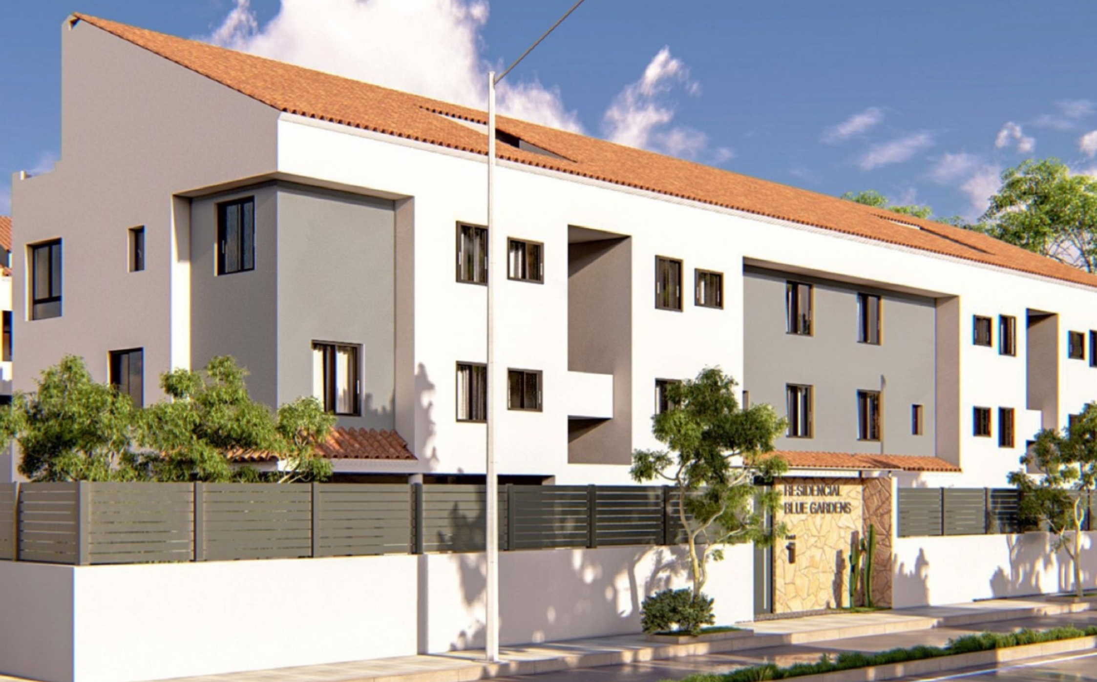
Duplex Penthouse in BLUE GARDENS, JÁVEA MONTAÑAR - EL ARENAL, JÁVEA/XÀBIA - REF. BG125