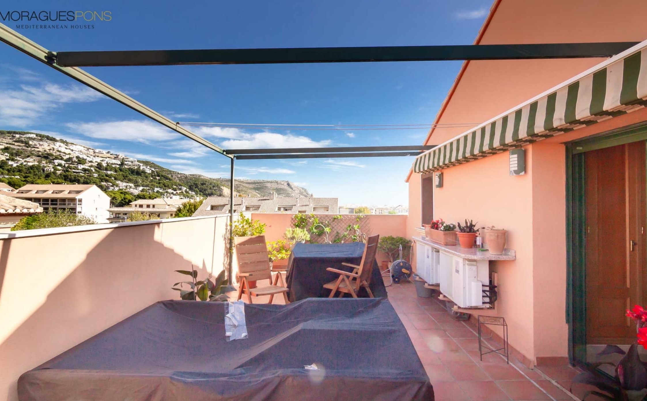
Duplex penthouse in Jávea Port JÁVEA/XÀBIA - REF. A-309