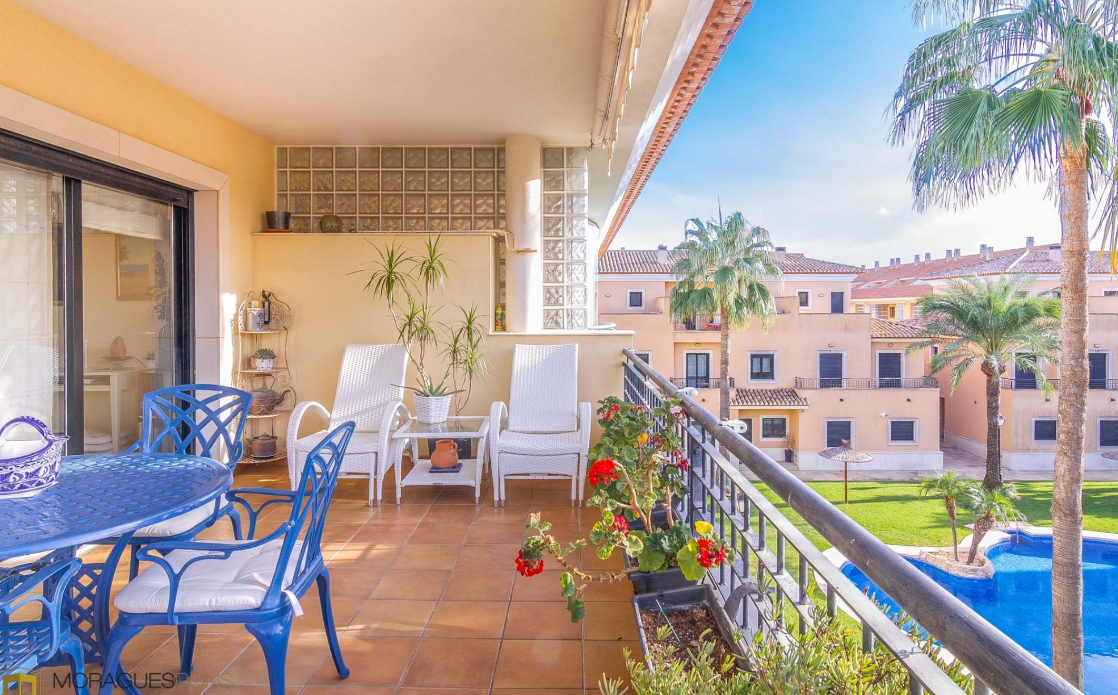
Duplex penthouse on the Arenal beach of Jávea MONTAÑAR - EL ARENAL, JÁVEA/XÀBIA - REF. A-383