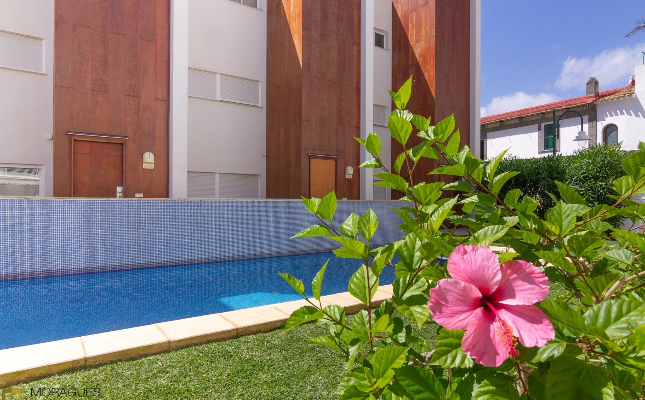
Duplex with private pool in the port of Jávea PORT, JÁVEA/XÀBIA - REF. A-380