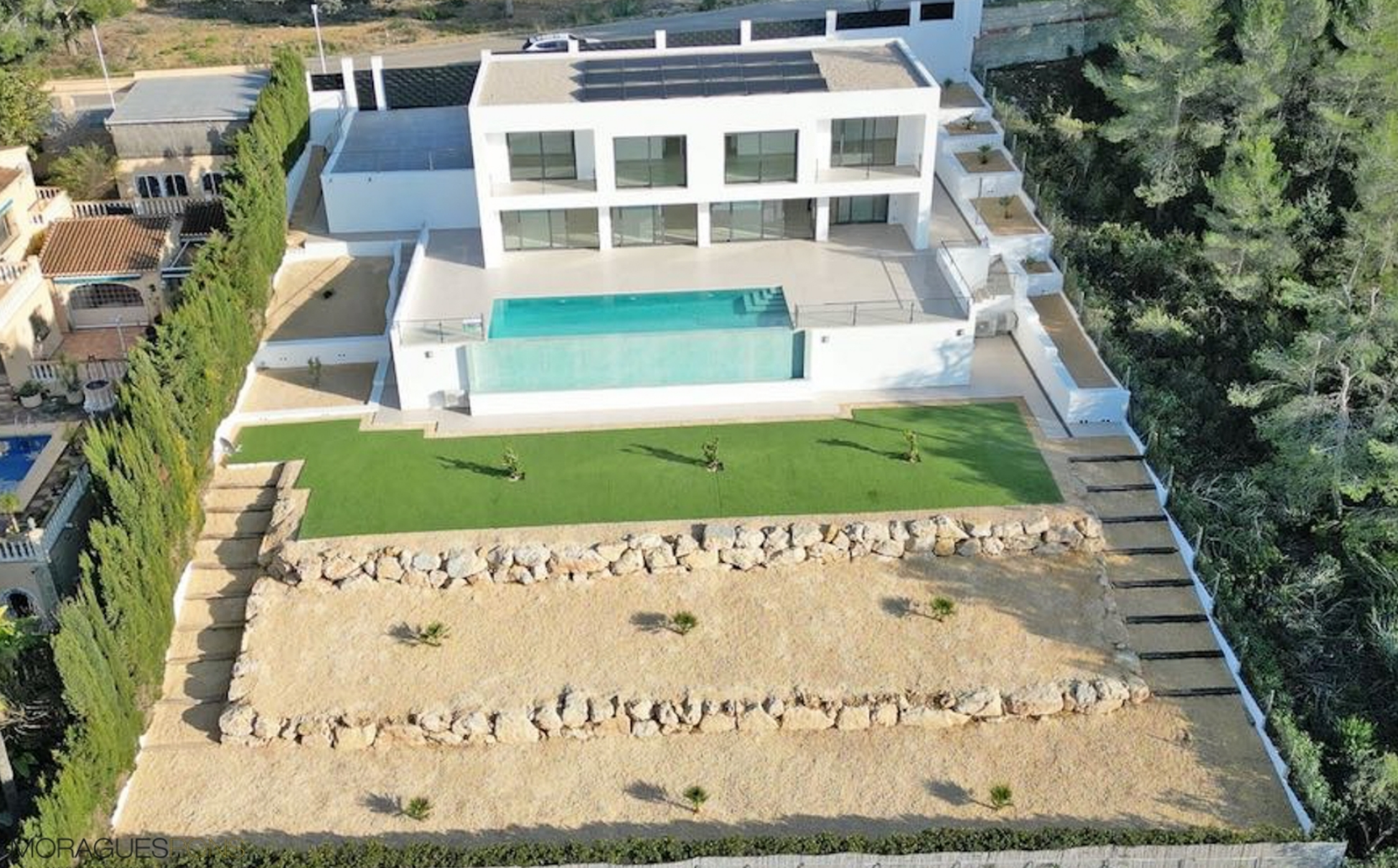
Exclusive Family Villa , Jávea JÁVEA/XÀBIA - REF. V-181