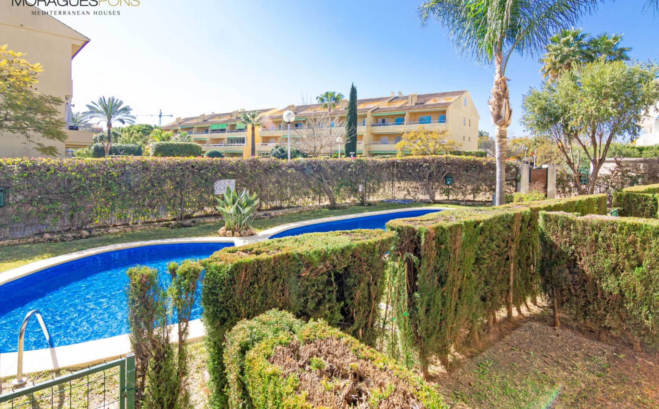
Fantastic apartment for sale in Calle Génova MONTAÑAR - EL ARENAL, JÁVEA/XÀBIA - REF. A-317