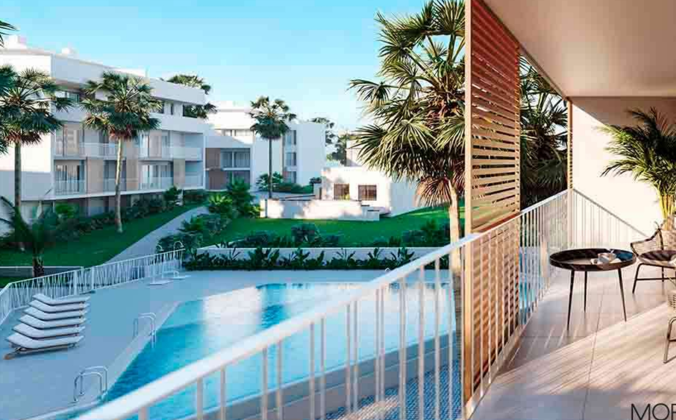
First floor apartment in the UNIC Residential OLD TOWN CENTER, JÁVEA/XÀBIA – REF. UNIC 231C