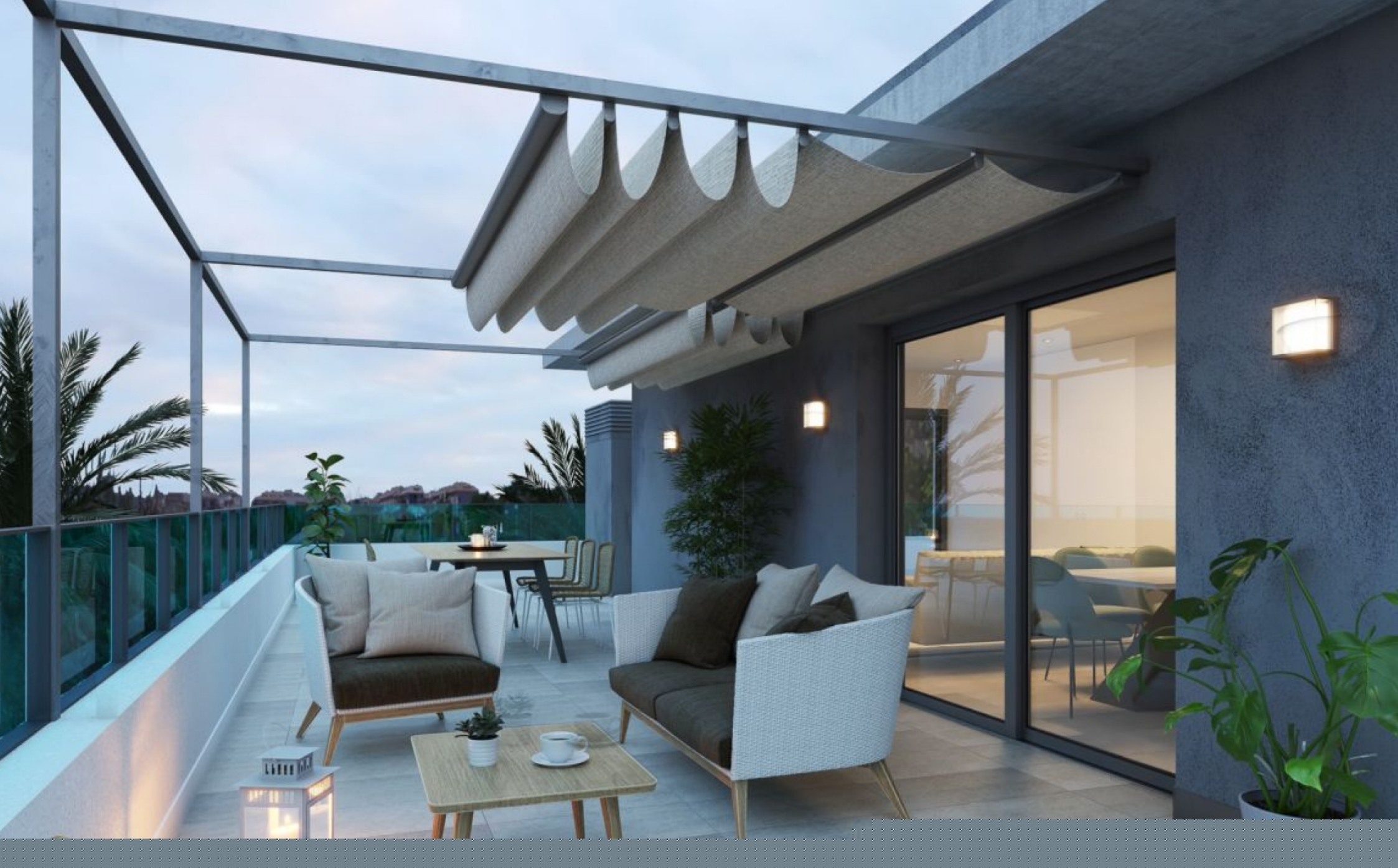
Flat in the Port , in Jardines del Gorgos, Jávea PORT, JÁVEA/XÀBIA - REF. A-313