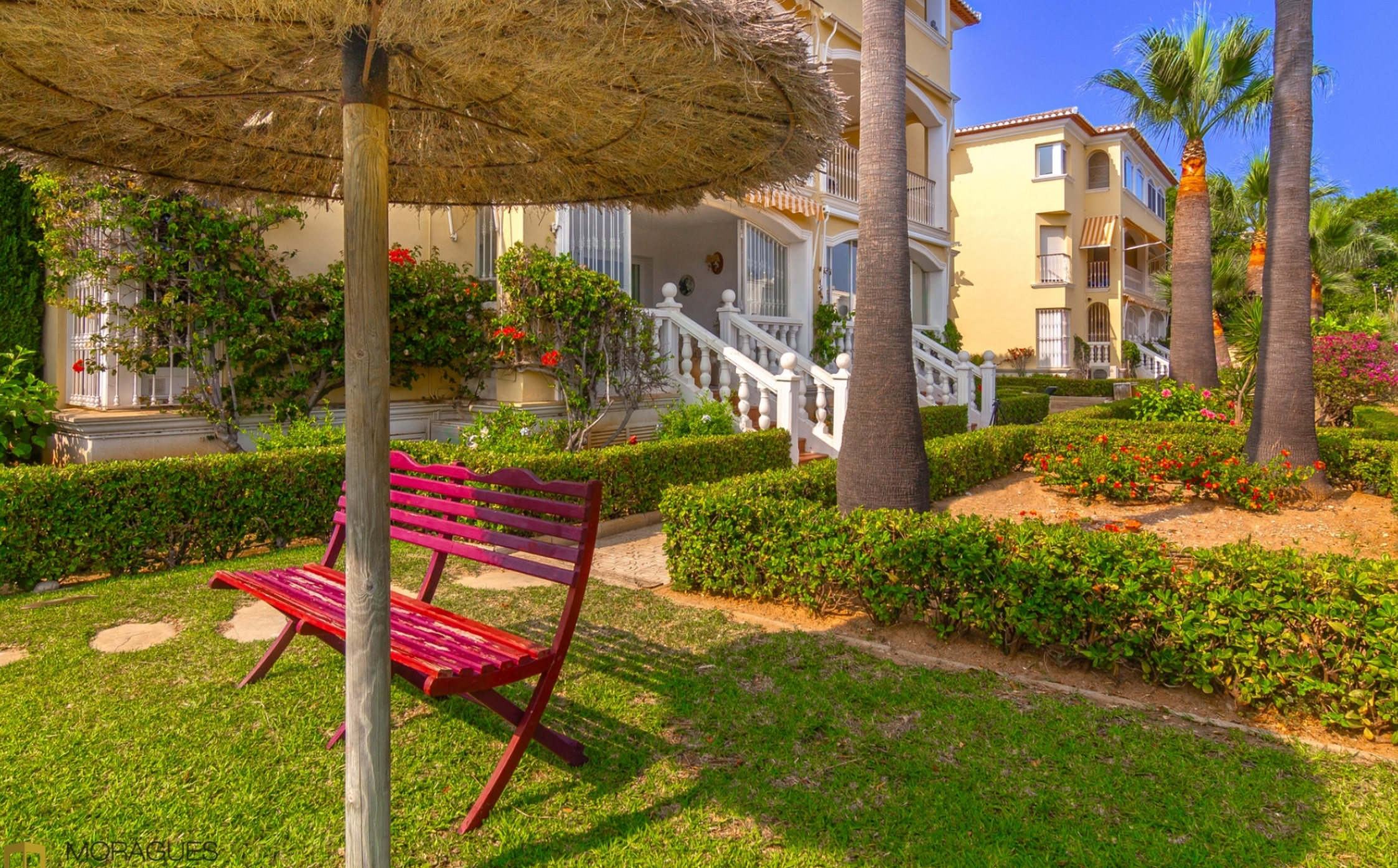
Ground floor apartment in the port of Jávea PORT, JÁVEA/XÀBIA - REF. A-374