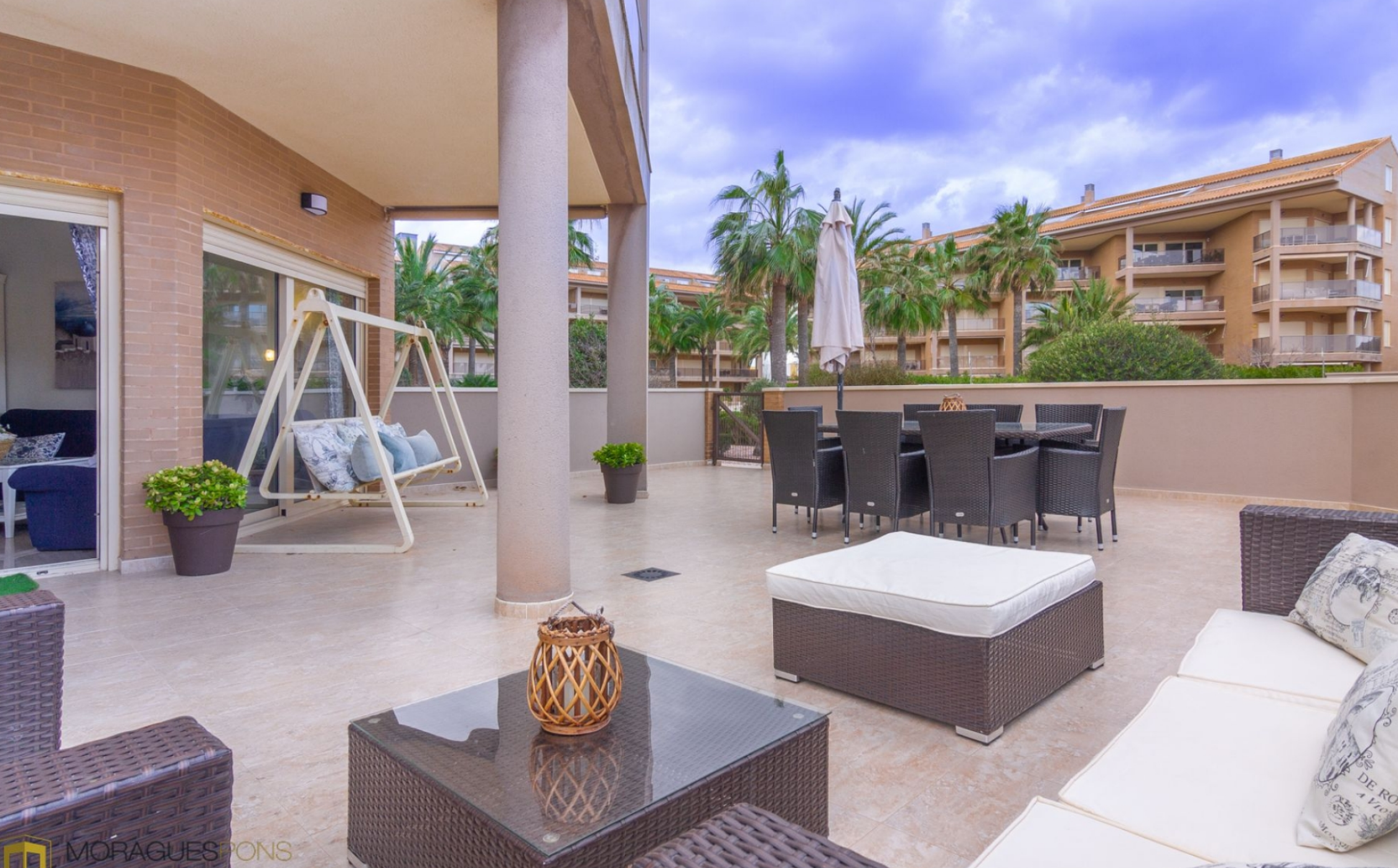
Ground floor apartment on the Arenal beach of Jávea MONTAÑAR - EL ARENAL, JÁVEA/XÀBIA - REF. A-364