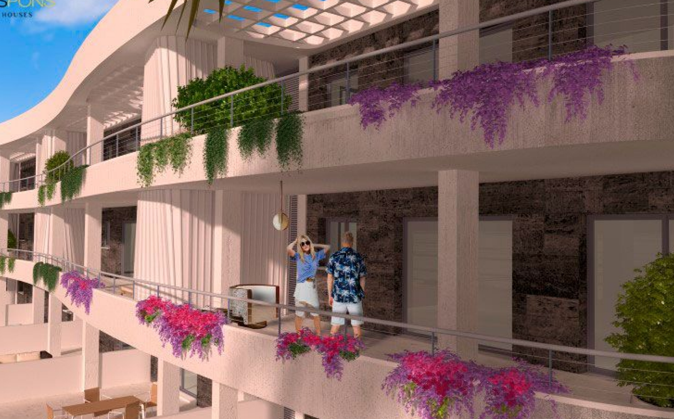
Ground floor apartment with garden on the Arenal beach, Jávea. MONTAÑAR - EL ARENAL, JÁVEA/XÀBIA - REF. TERRAZAS A1B