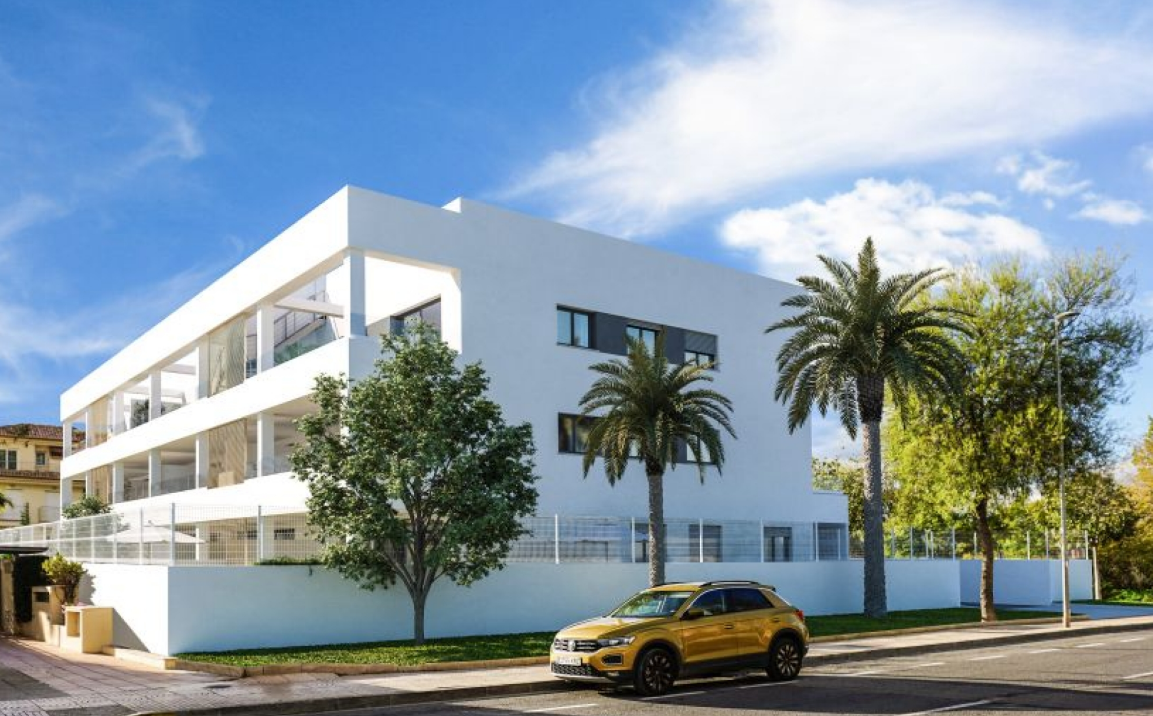
Ground floor apartment with sea views and private pool in Jávea MONTAÑAR - EL ARENAL, JÁVEA/XÀBIA - REF. A-375