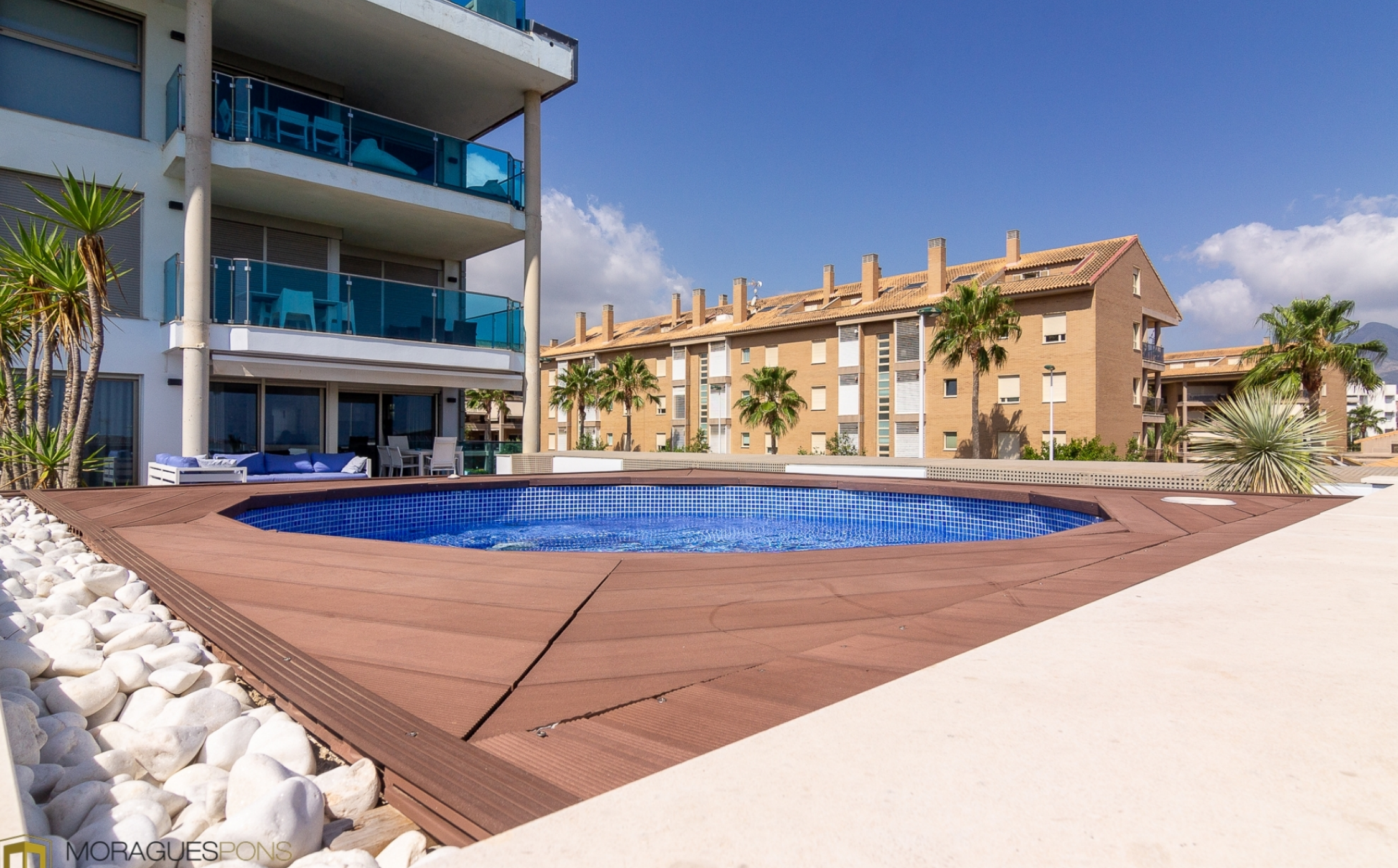
Ground floor apartment with sea views and private pool in Jávea MONTAÑAR - EL ARENAL, JÁVEA/XÀBIA - REF. A-375