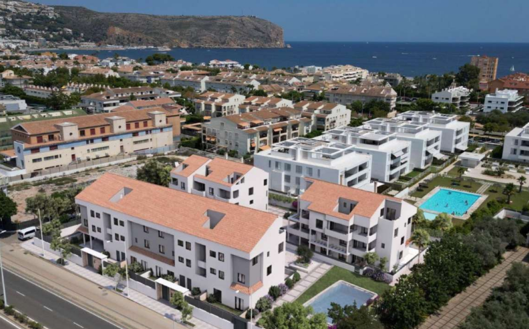
Ground Floor in BLUE GARDENS, Jávea MONTAÑAR - EL ARENAL, JÁVEA/XÀBIA - REF. BG201