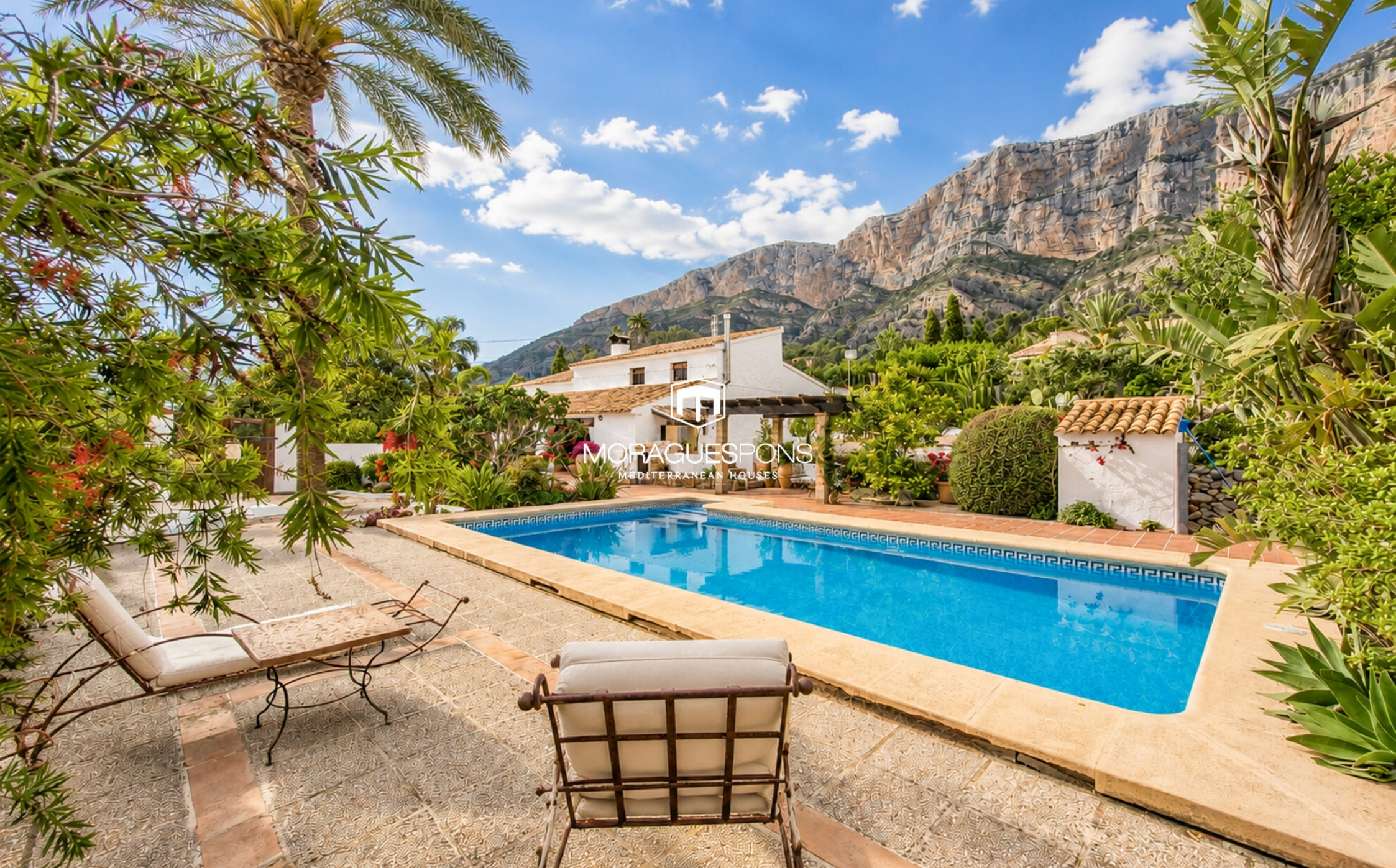
Historic Mediterranean finca in Montgó Jávea JÁVEA/XÀBIA - REF. V-1676