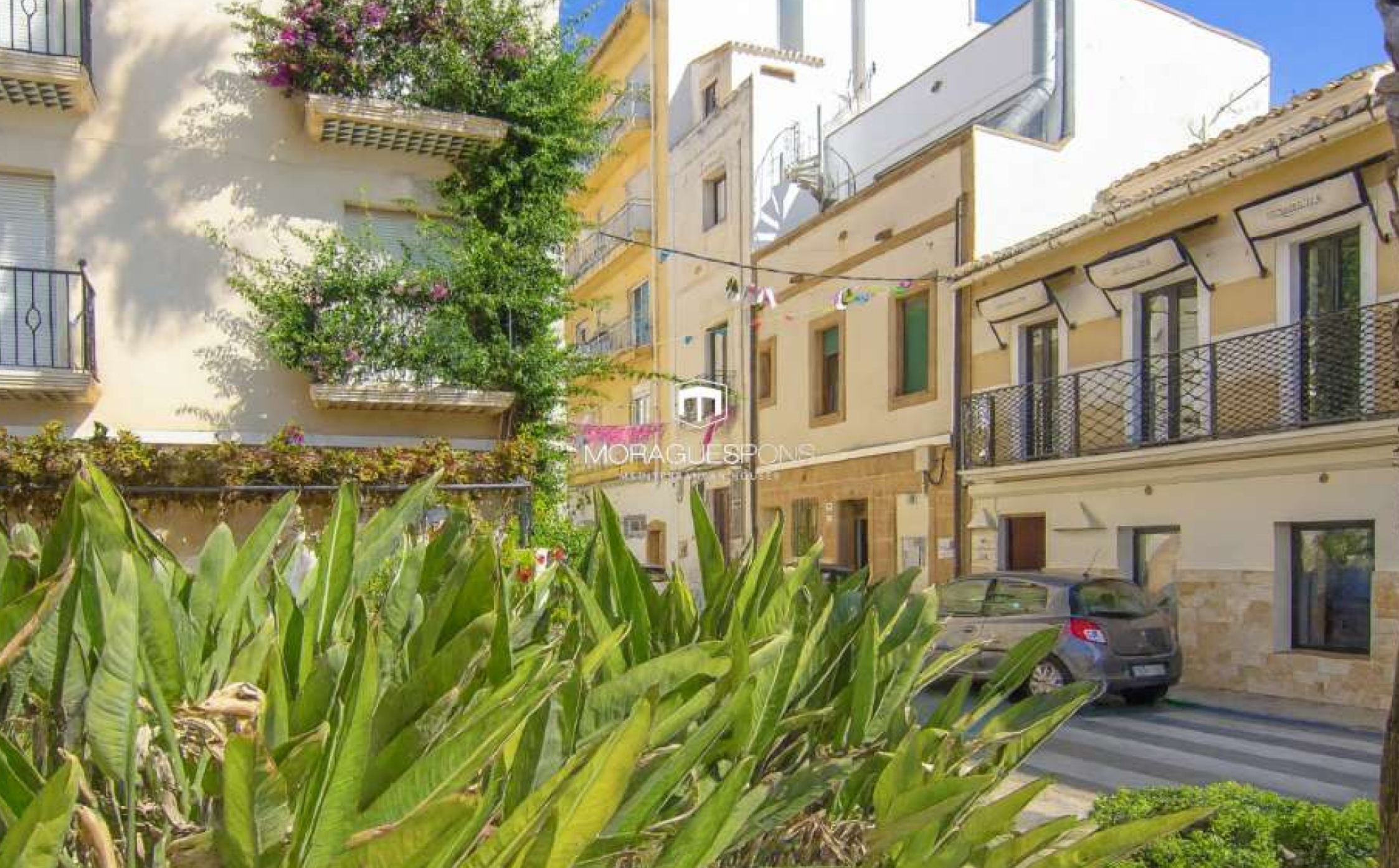
House for sale in the port of Jávea PORT, JÁVEA/XÀBIA - REF. V-1570