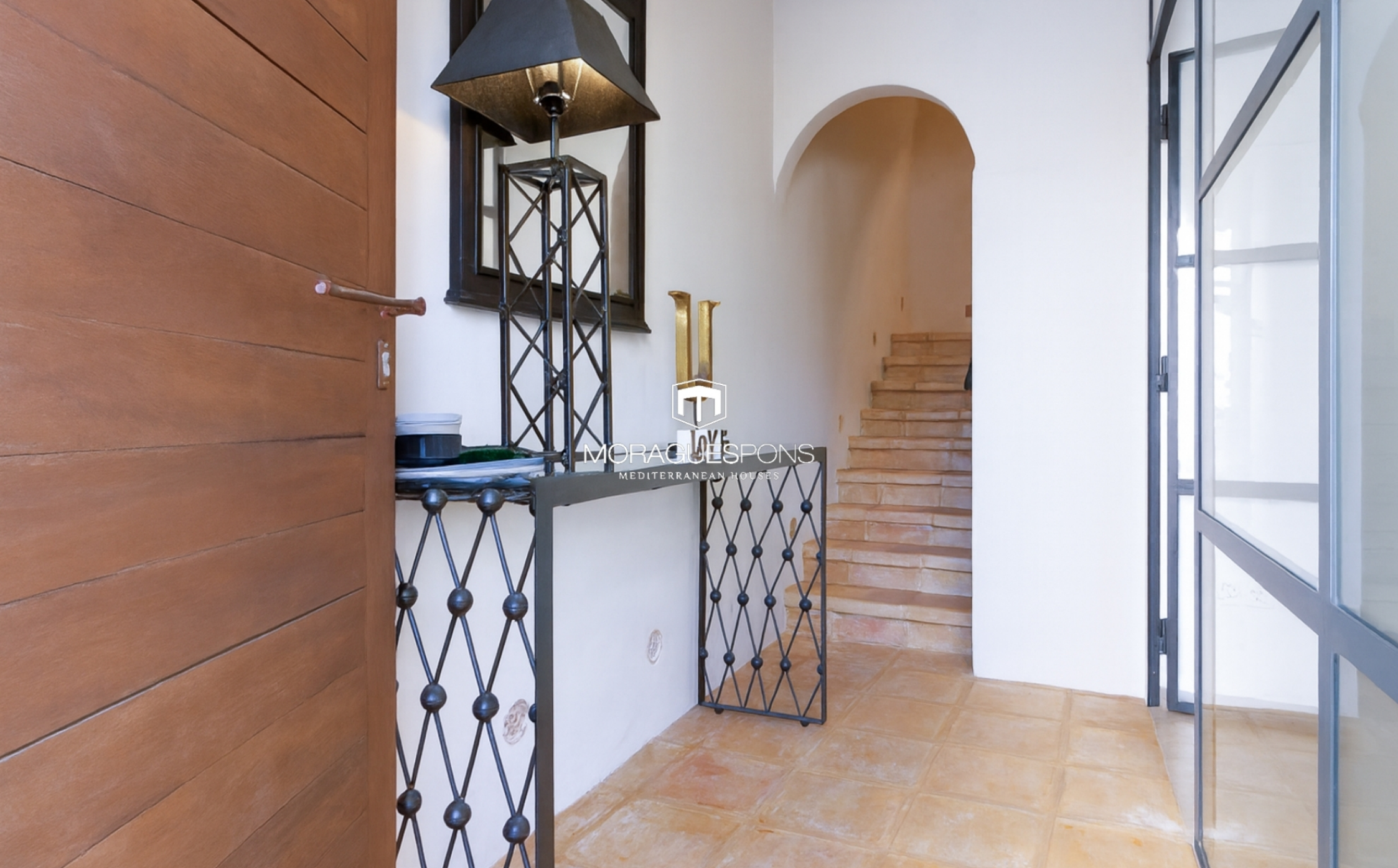
House for sale in the port of Jávea PORT, JÁVEA/XÀBIA - REF. V-510