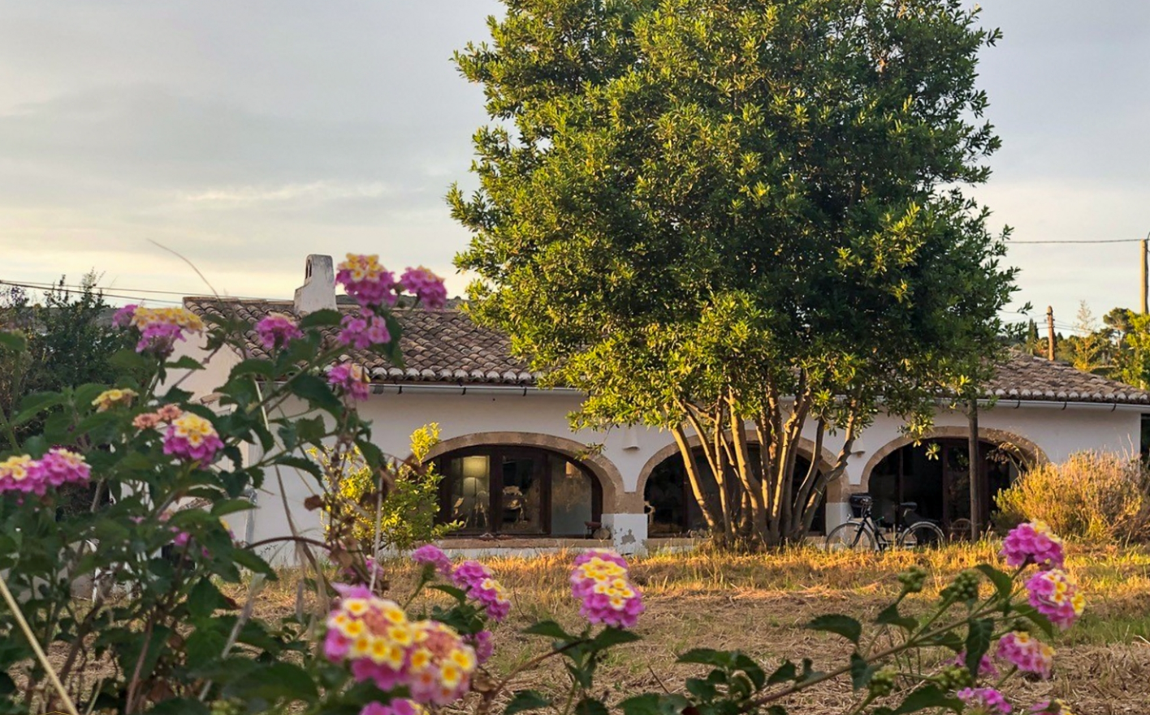
House in Javea at the foot of the Montgo with a large plot JÁVEA/XÀBIA - REF. V-523