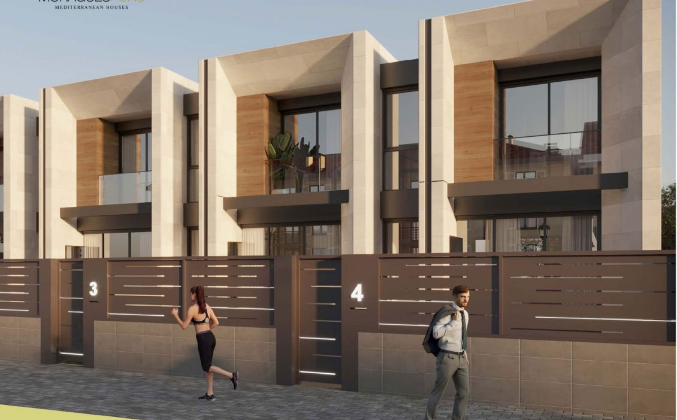
House with private pool in Gata de Gorgos GATA DE GORGOS - REF. NATURE 3