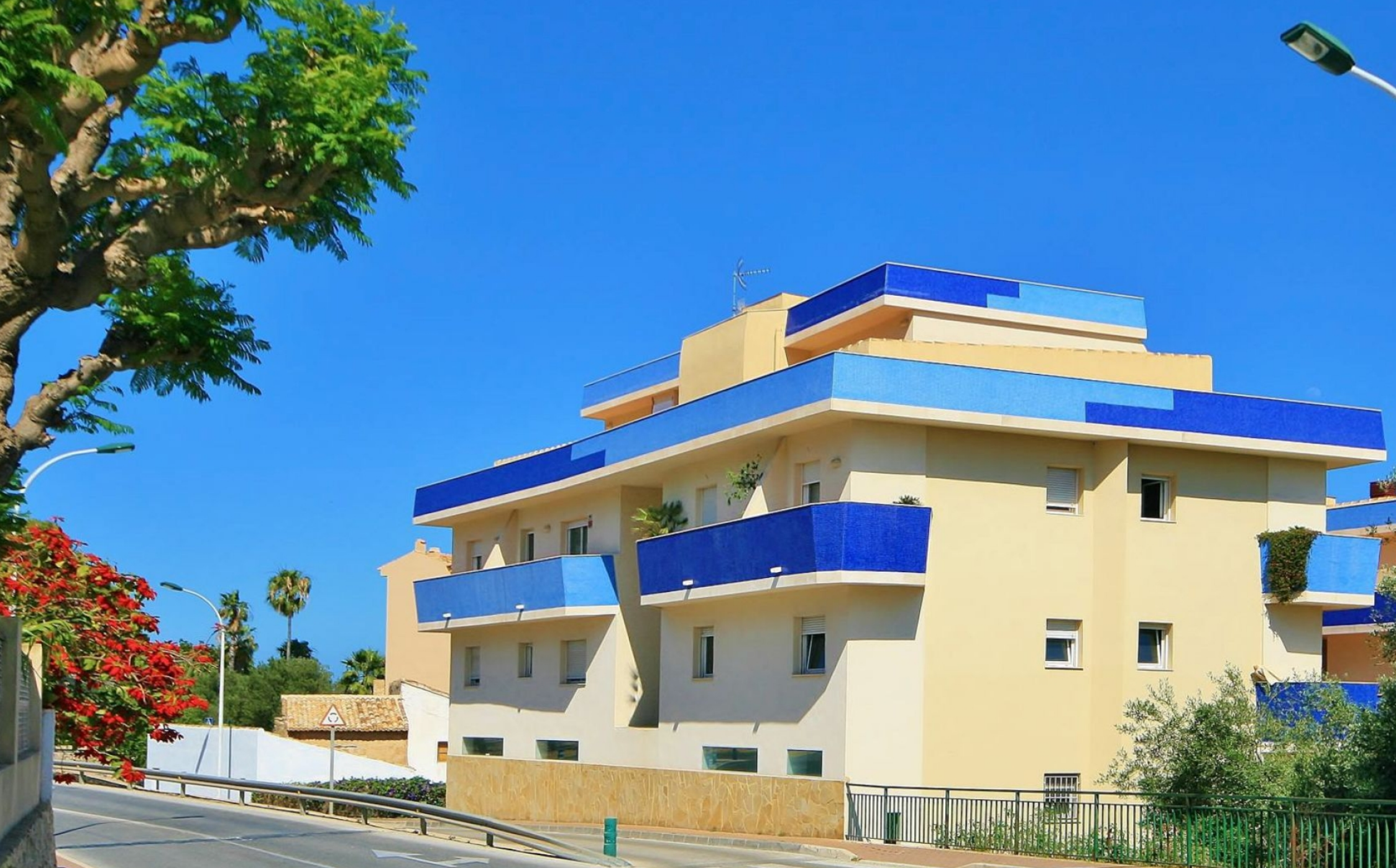
Javea apartment with three rooms OLD TOWN CENTER, JÁVEA/XÀBIA - REF. A-354