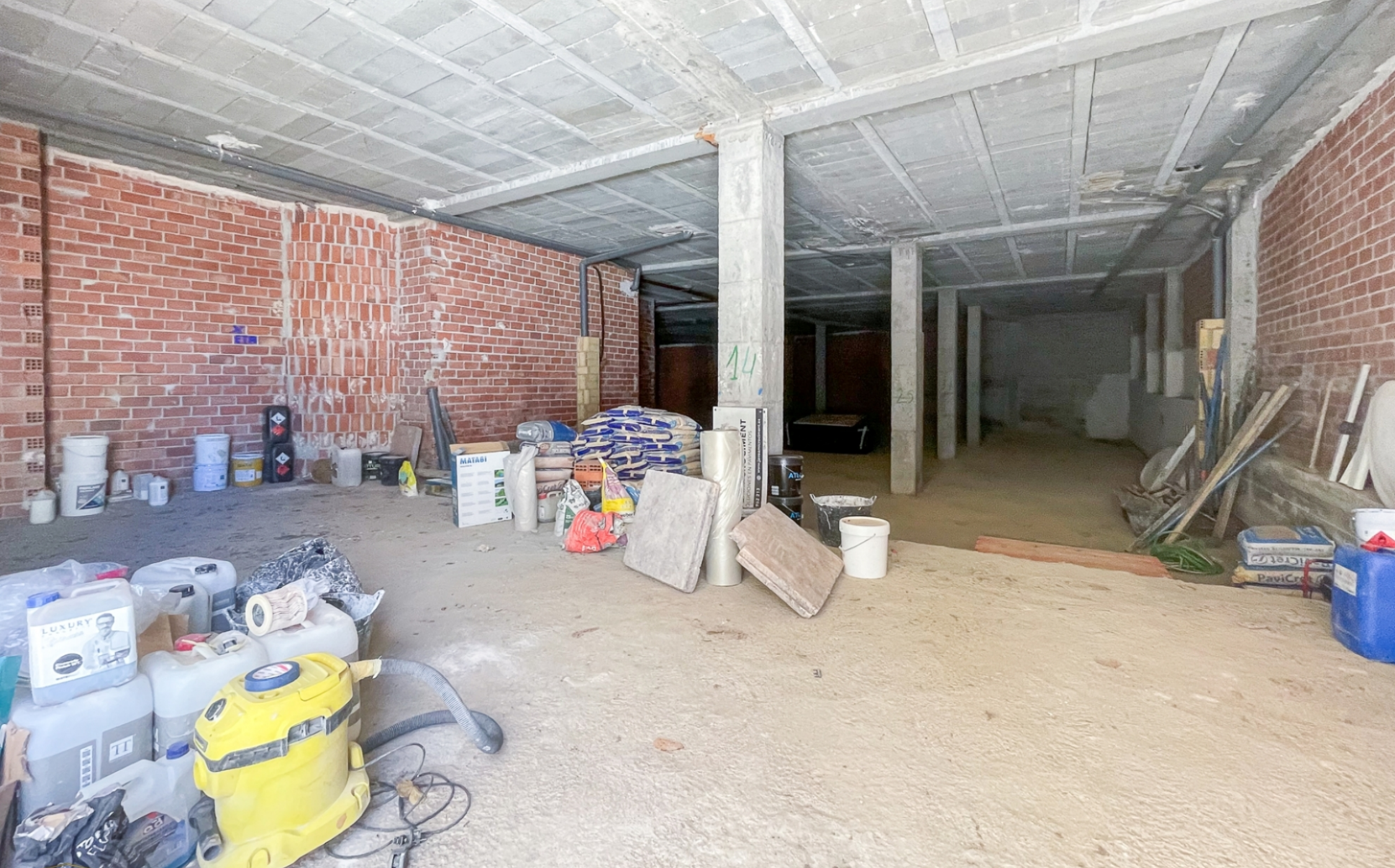
Large premises for sale in the centre of Jávea OLD TOWN CENTER, JÁVEA/XÀBIA - REF. LC-4