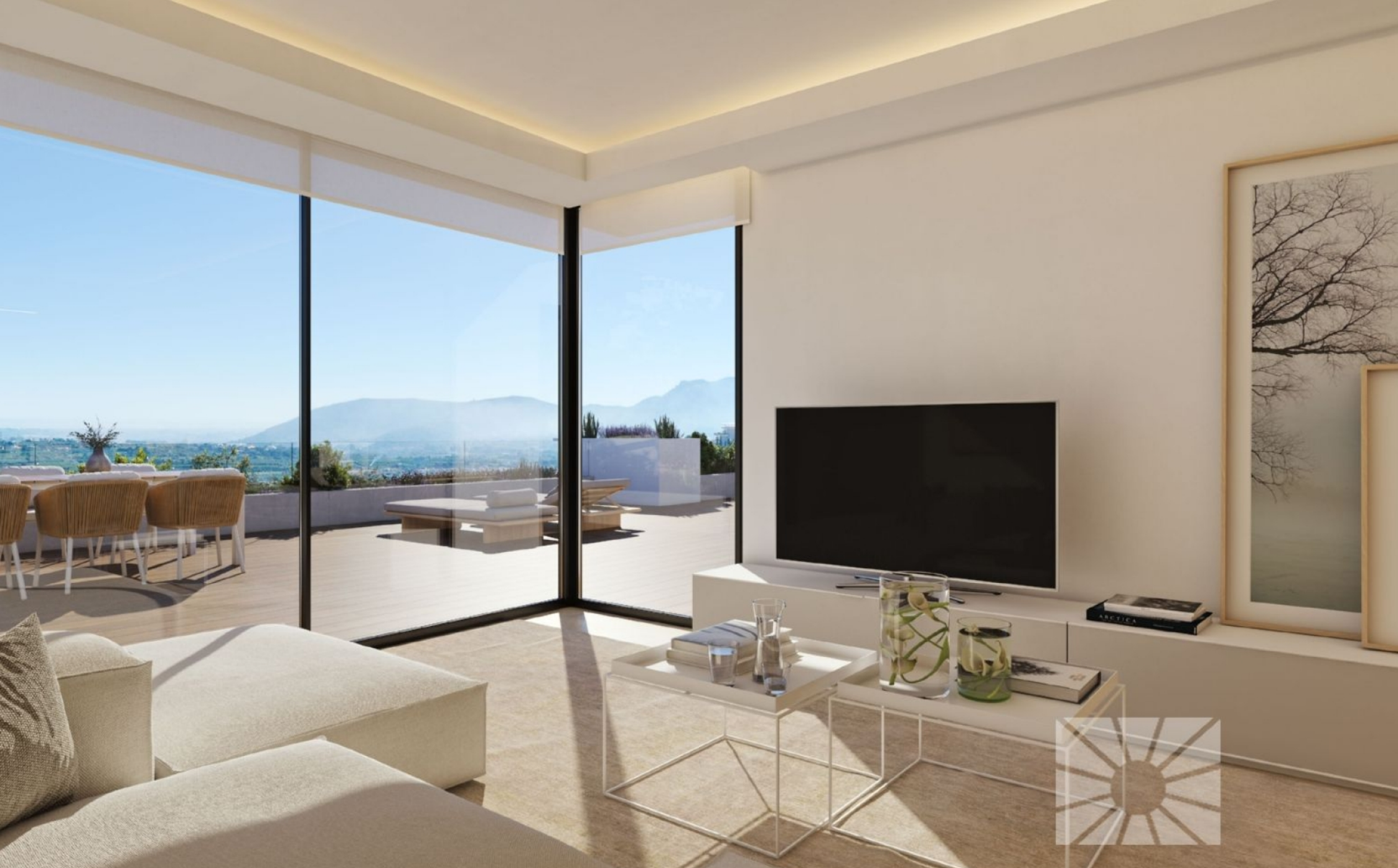
Luxury apartment in La Sella PEDREGUER - REF. OV-DBD08