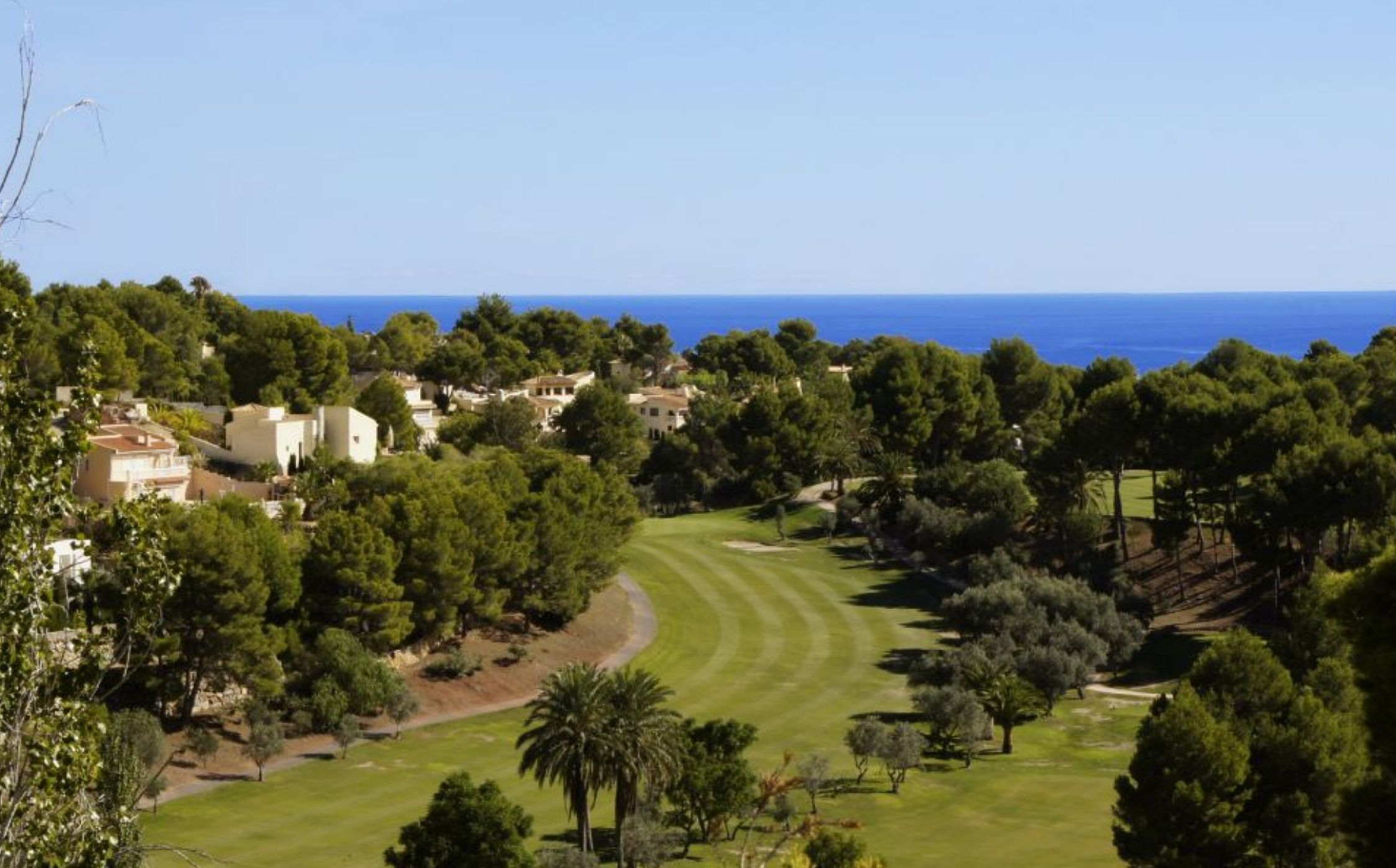
Luxury villa in Altea overlooking the Mediterranean Sea ALTEA - REF. OV-HC015