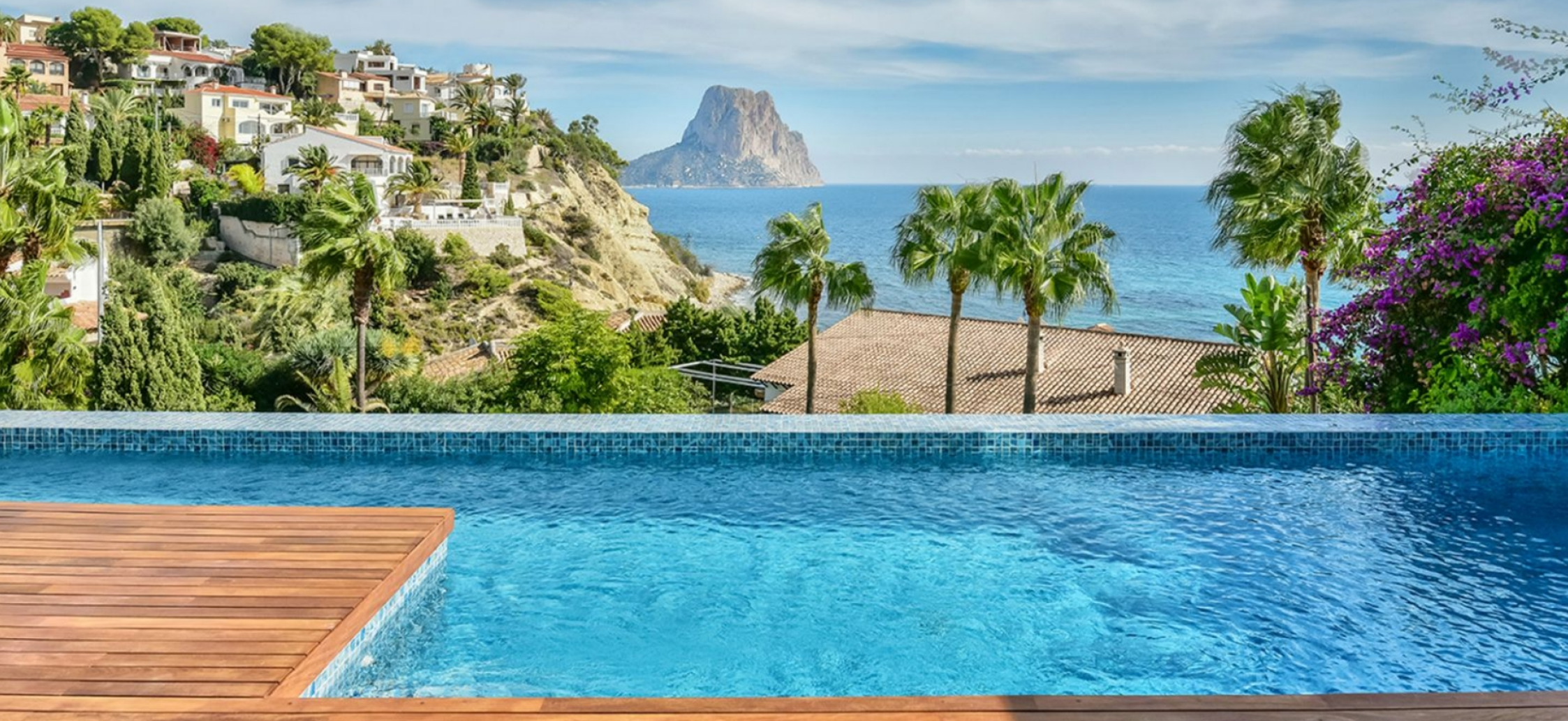
Luxury villa in Calpe with views to the Peñon de Ifach