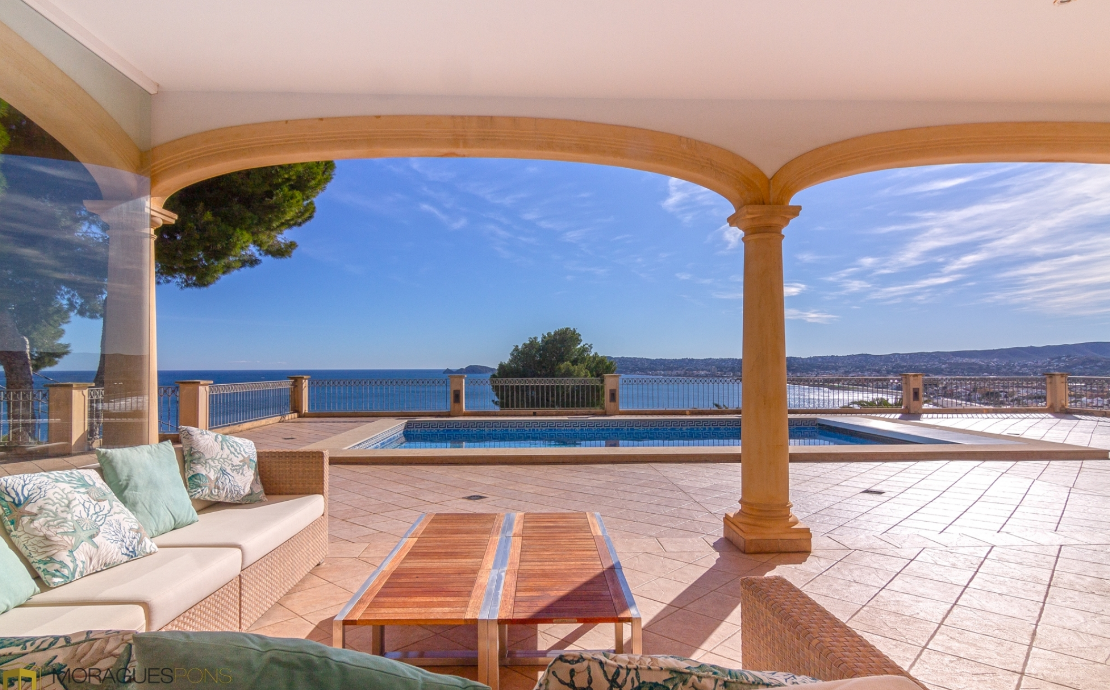
Luxury Villa in Jávea: exclusivity and sea views CUESTA SAN ANTONIO - PUCHOL, JÁVEA/XÀBIA - REF. V-522