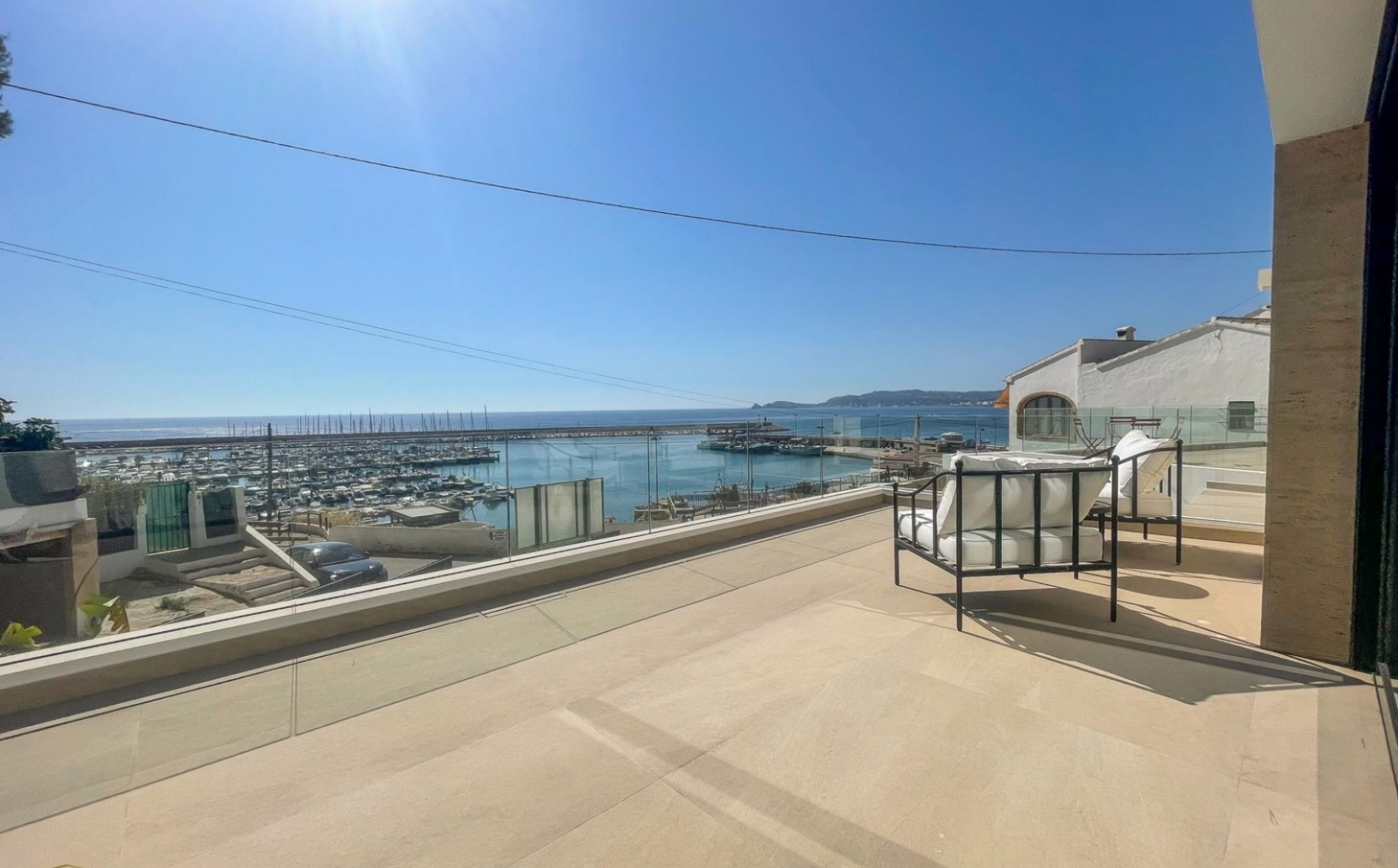
Luxury villa on the seafront in the port of Jávea PORT, JÁVEA/XÀBIA - REF. V-345