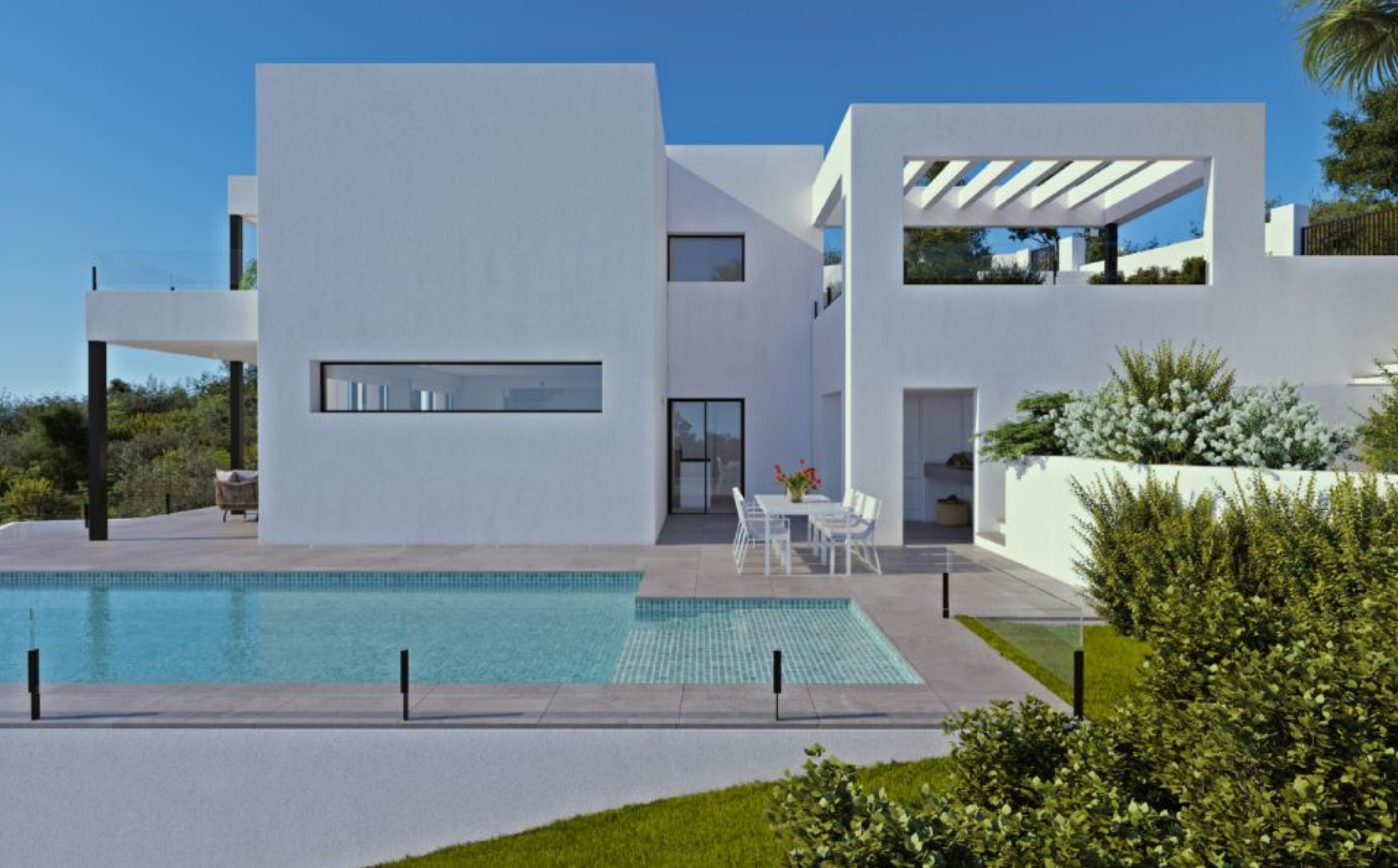
Magnolias For Life Cumbre del Sol modern villa for sale POBLE NOU DE BENITATXELL - REF. OV-AM124