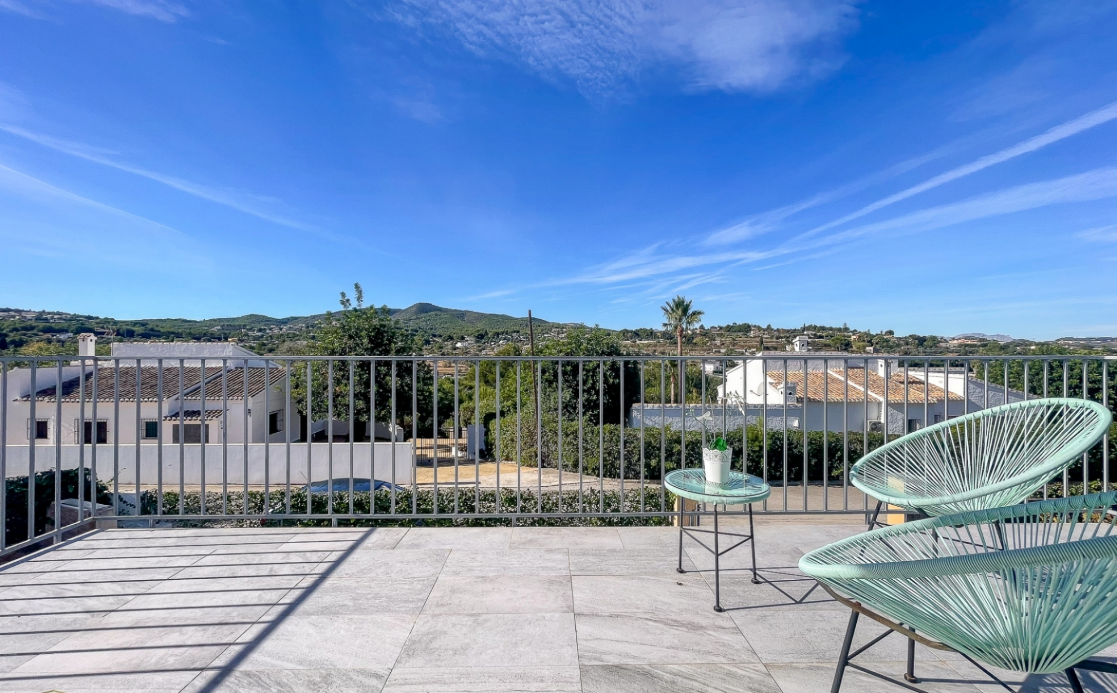
Mediterranean villa with pool and open views in Jávea PARTIDA COMUNES - ADSUBIA, JÁVEA/XÀBIA - REF. V-406