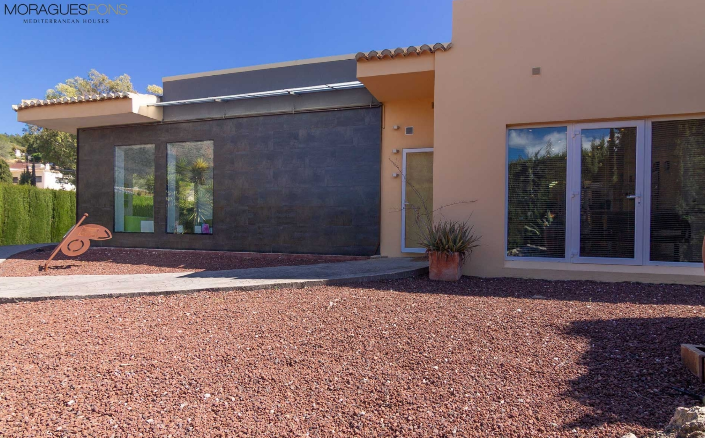
Vila in Jávea

MONTGÓ - PARTIDA TOSAL, JÁVEA/XÀBIA - REF. V-525