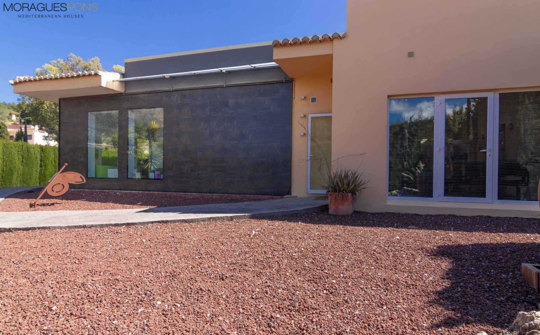
Multifunctional Commercial Space in Jávea – Ideal for Businesses and Professionals MONTGÓ - PARTIDA TOSAL, JÁVEA/XÀBIA - REF. V-525