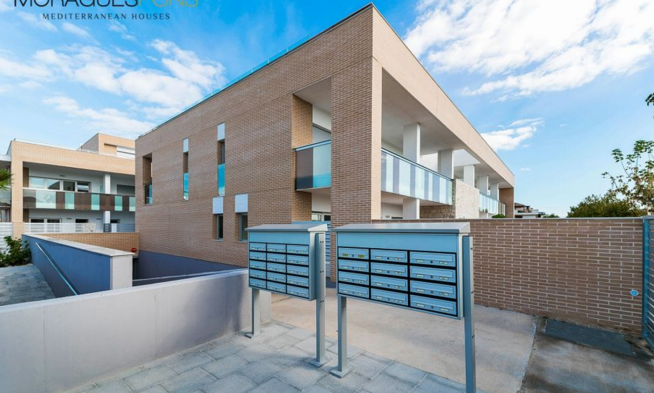
New build next to the port of Javea OLD TOWN CENTER, JÁVEA/XÀBIA - REF. III-13