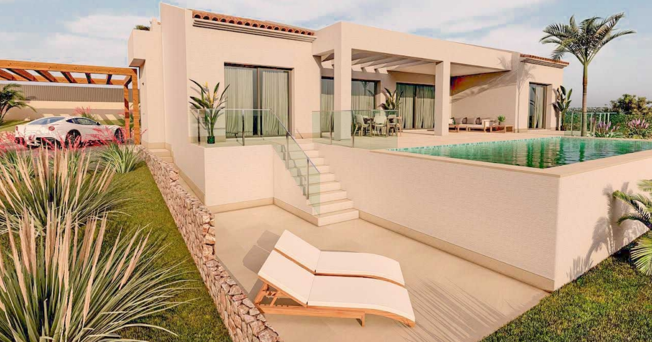
New build villa in Las Laderas, Jávea, Alicante. PARTIDA COMUNES - ADSUBIA, JÁVEA/XÀBIA - REF. V-517