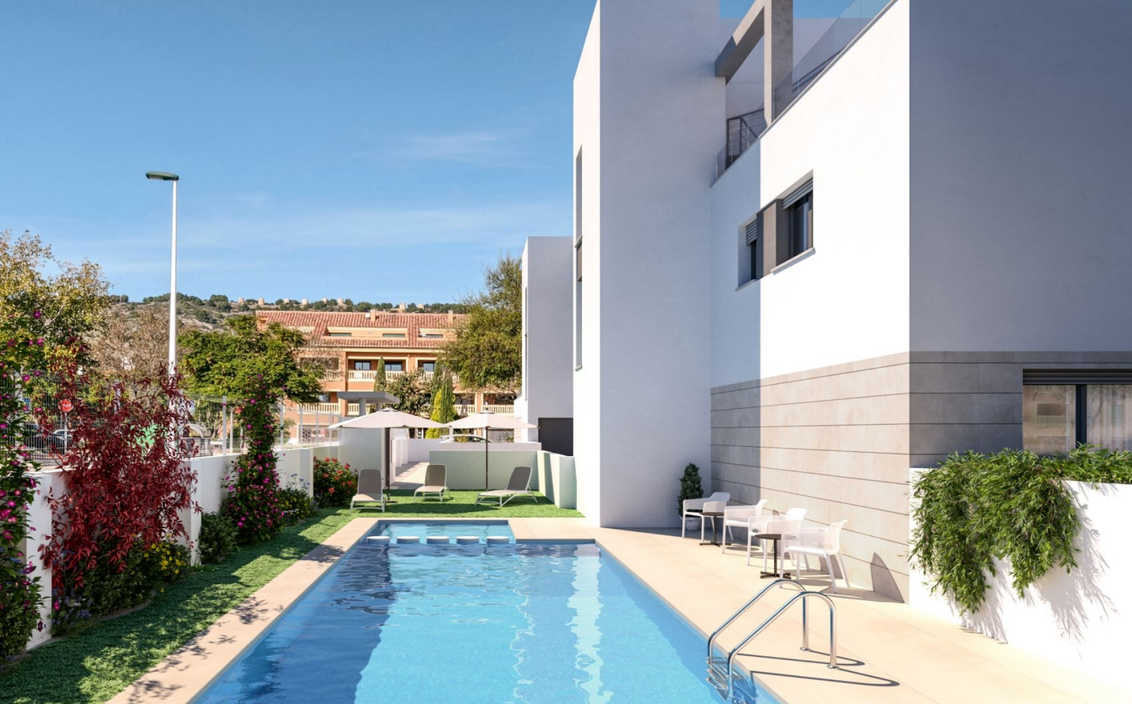
New construction apartment on the ground floor with garden in the port of Jávea PORT, JÁVEA/XÀBIA - REF. 0-A