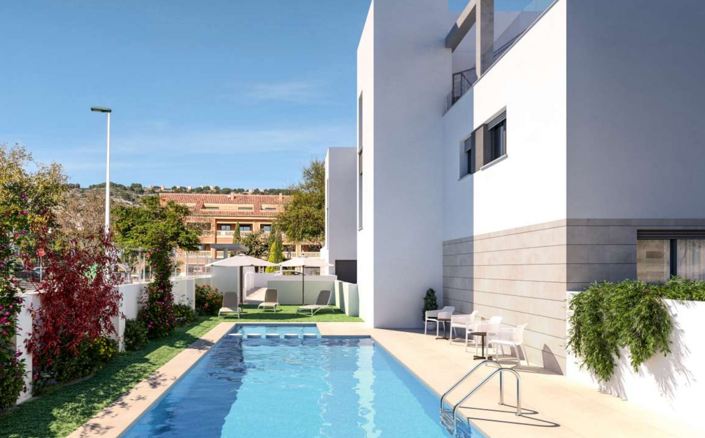
New construction apartment on the ground floor with garden in the port of Jávea PORT, JÁVEA/XÀBIA - REF. 0-B