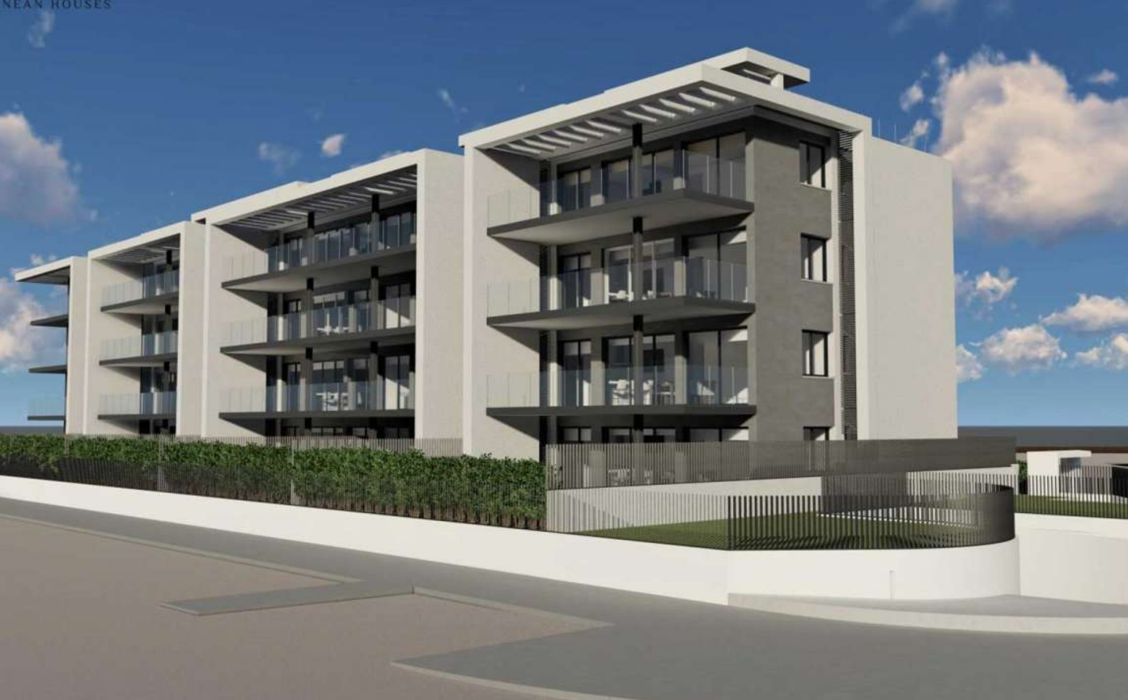
New construction ground floor under construction on the arenal beach of Jávea MONTAÑAR - EL ARENAL, JÁVEA/XÀBIA - REF. C2-A