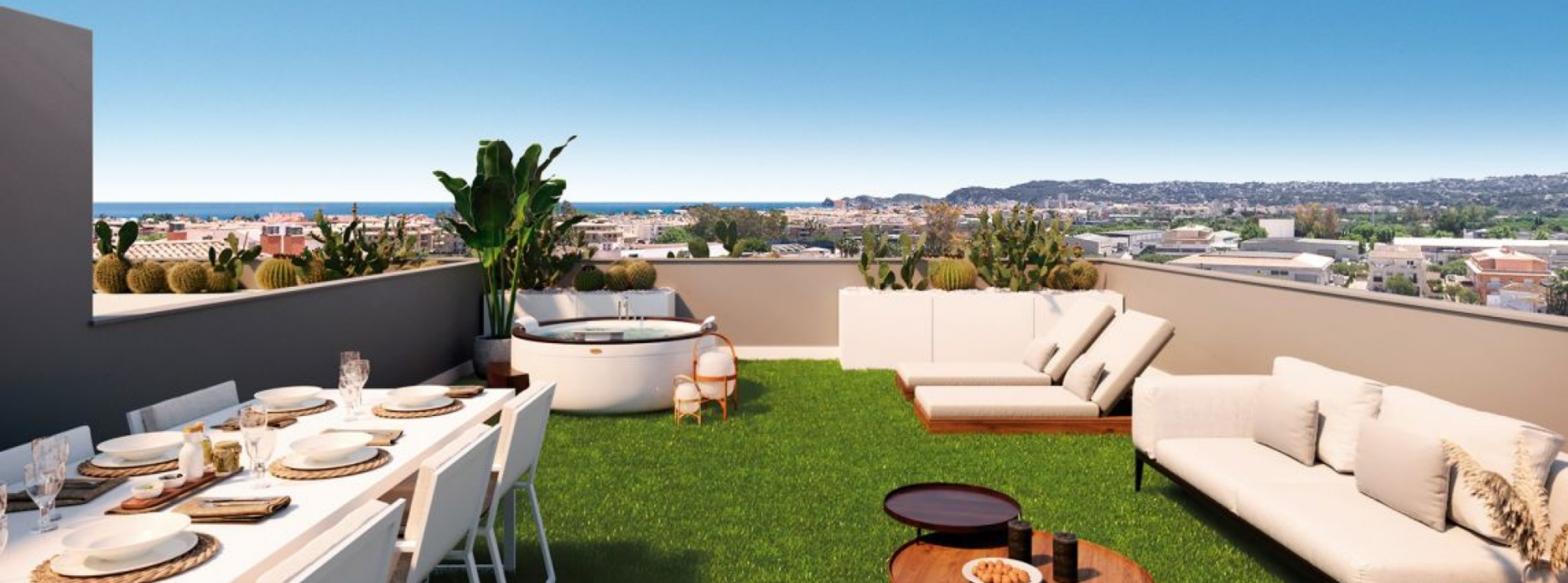
New residential Essencial Jávea, new build penthouse with solarium and sea views OLD TOWN CENTER, JÁVEA/XÀBIA - REF. EB3-74