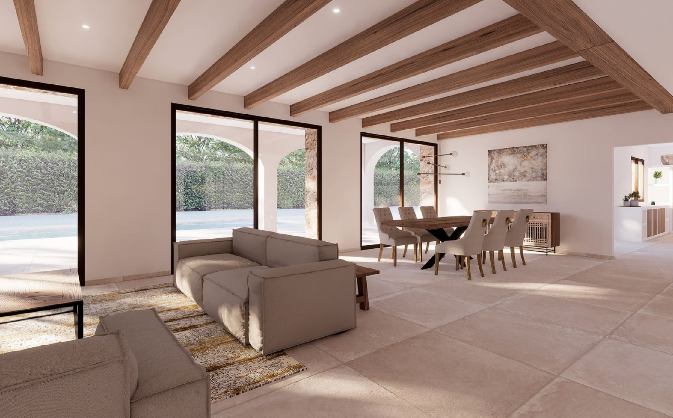
Newly built finca in Benisa BENISSA - REF. LLENES