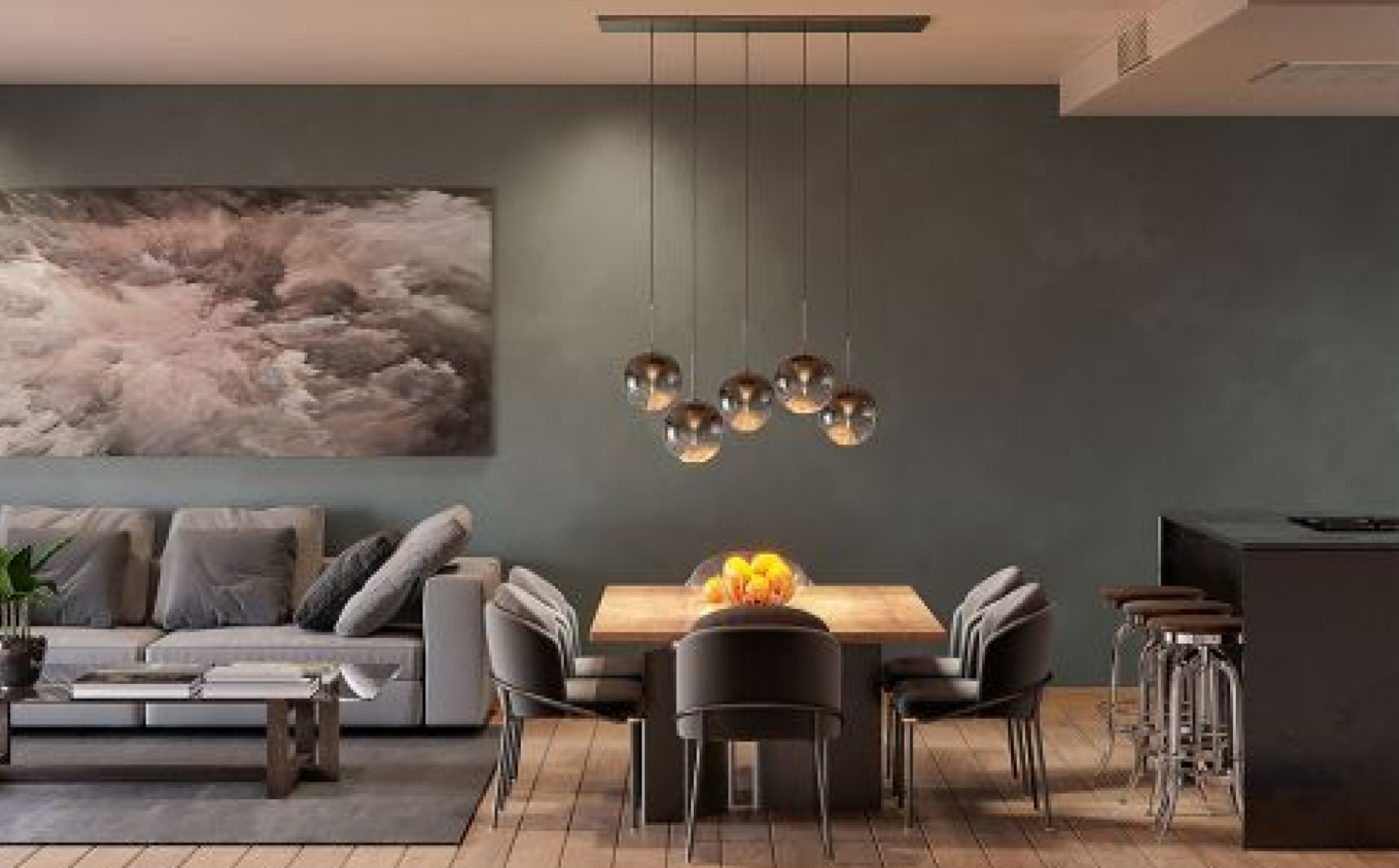
Newly built flat with swimming pool in the port of Jávea PORT, JÁVEA/XÀBIA - REF. PRIME7D