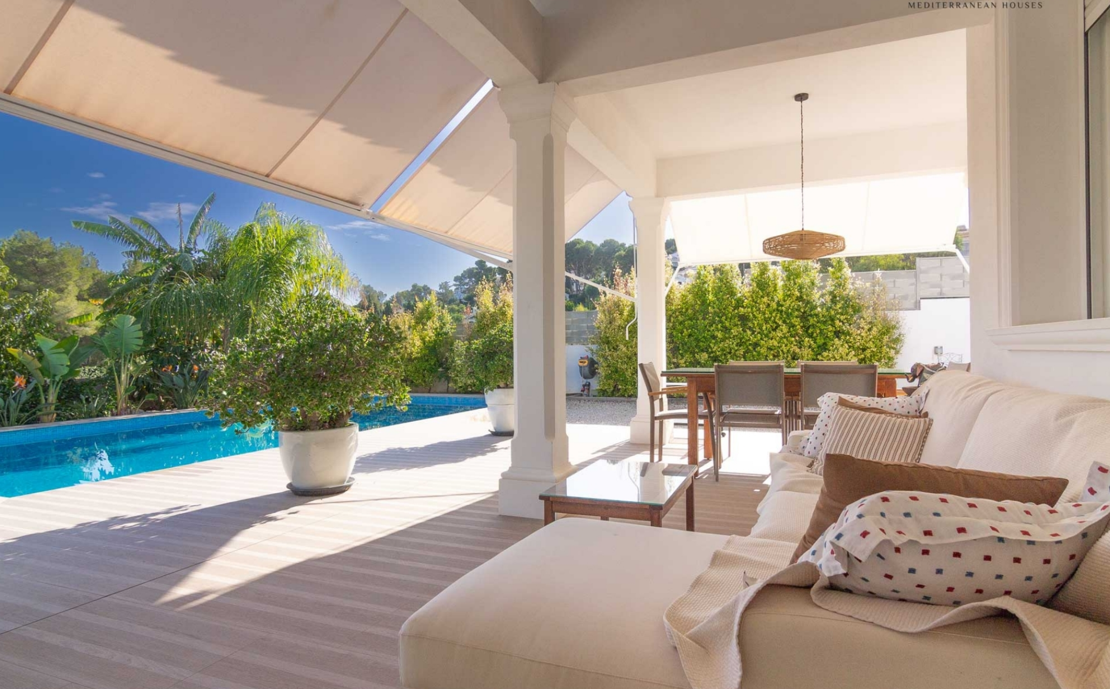
Newly built villa in Pinosol, Jávea, Alicante. CAP MARTÍ - PINOMAR, JÁVEA/XÀBIA - REF. V-437